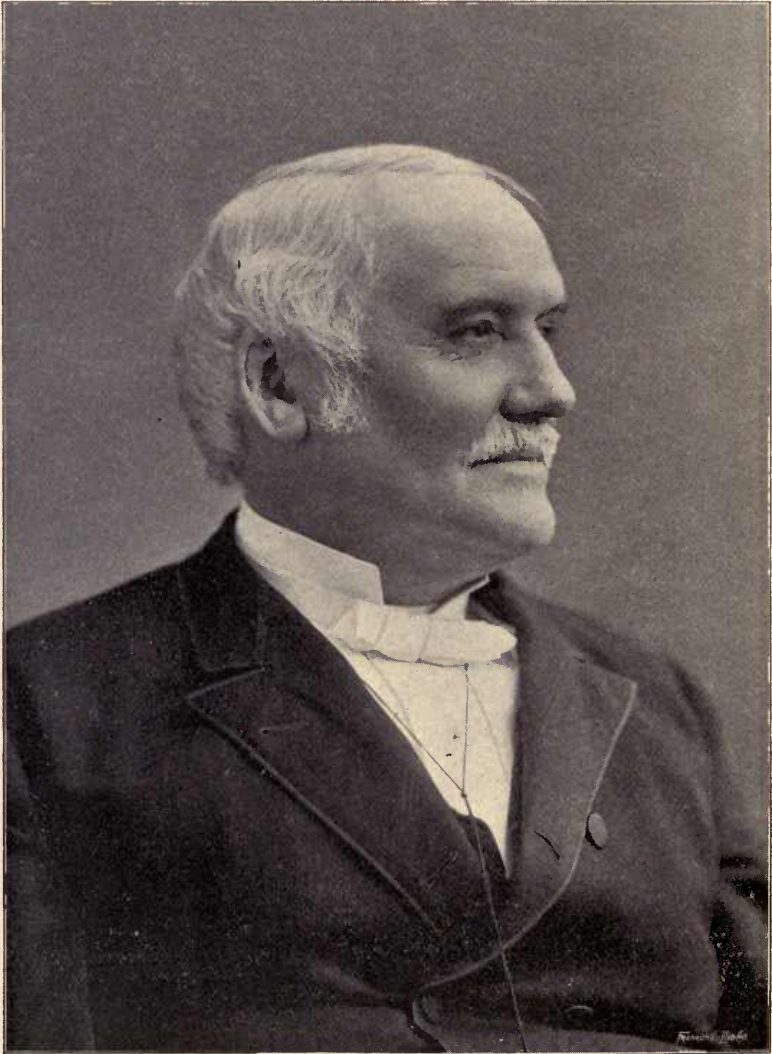
COL. A. K. McCLURE.