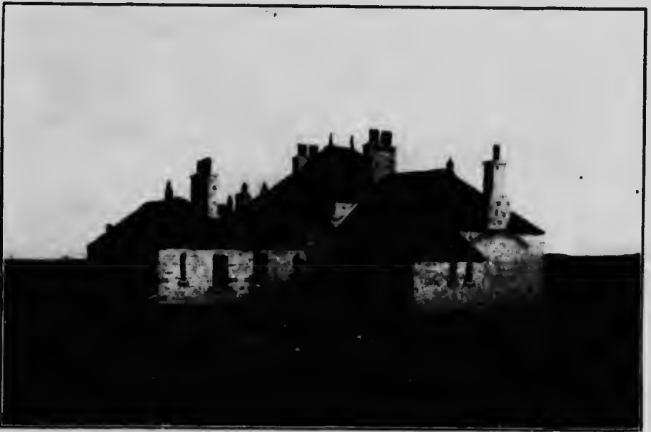
THE REAR AND WEST VIEW OF LEWIS HOSPITAL.