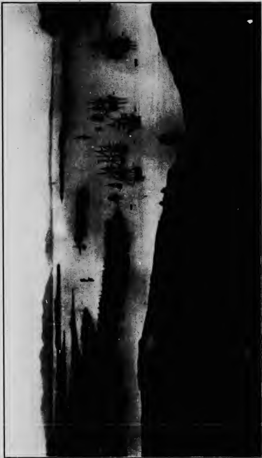
THE TOWN OF STOROWAY, ON THE ISLAND OF LEWIS, IN 1819.