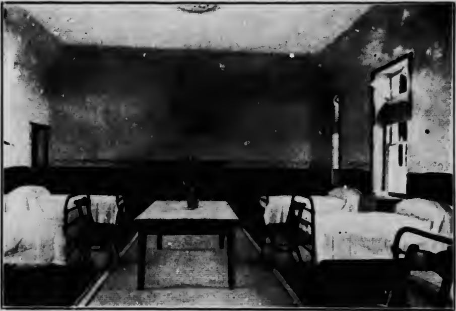
THE INTERIOR OF THE EAST WARD, LEWIS HOSPITAL.