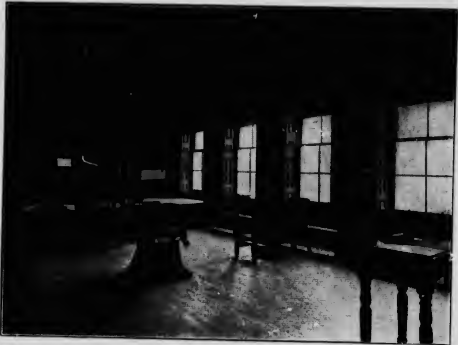
THE EAST END OF THE LODGE ROOM.

It has been one of the pleasures of my life to visit the house of my sires in Stornoway and to hear the people of that place say so