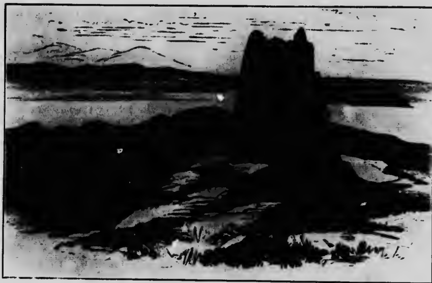
DUNE CARLOWAY, NEAR CALLERNISH.

At a later date the whole of The Lewis, including Stornoway, passed under the sway of the MacLeods of the Isles, and later still, in the beginning of the seventeenth century, when the MacLeod family fell under the ban of the Government, it came for a time into the hands of the Mackenzies, of Seaforth, and then by purchase, for £200,000, to the late Sir James Matheson, a Sutherlandshire family, whose heirs now possess the island.