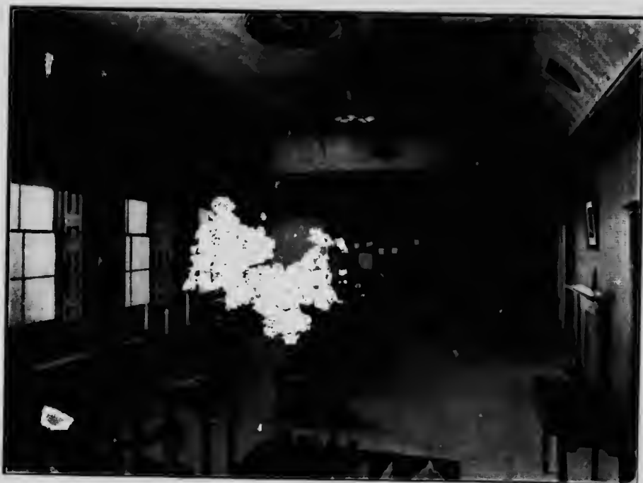
THE WEST END OF THE LODGE ROOM.

After a weary journey, the first half of which was on foot, my grandfather reached the historic city and was gratified by having a most favourable opinion and advice that right was on his side.