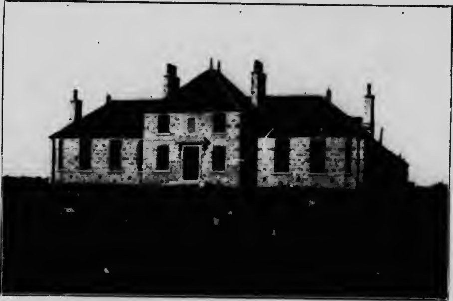
THE FRONT VIEW LEWIS HOSPITAL, STORNOWAY, BUILT 1895.

For be it remembered that it is the home of 26,000 of a lusty race, strong and vigorous—men robust and valorous, thousands of