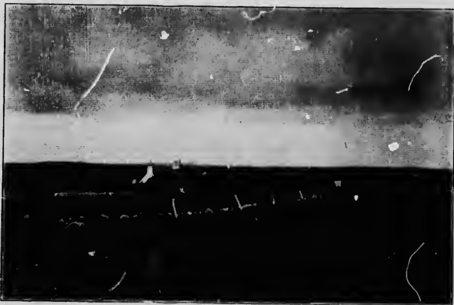
A DISTANT VIEW OF THE FARM OF GOATHILL.