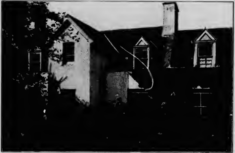
THE FARM HOUSE OF GOATHILL, NEAR STORNOWAY