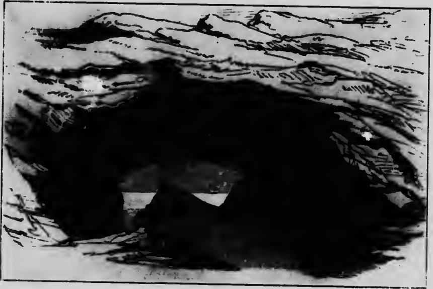
WHERE THE DEVIL FIXED HIS ROPE.

The tourist, if so disposed, may have a pleasant drive north about fifteen miles along the coast to Barvas (Barabhas) a little hamlet of 500 people, with a church, an inn, a school and a few