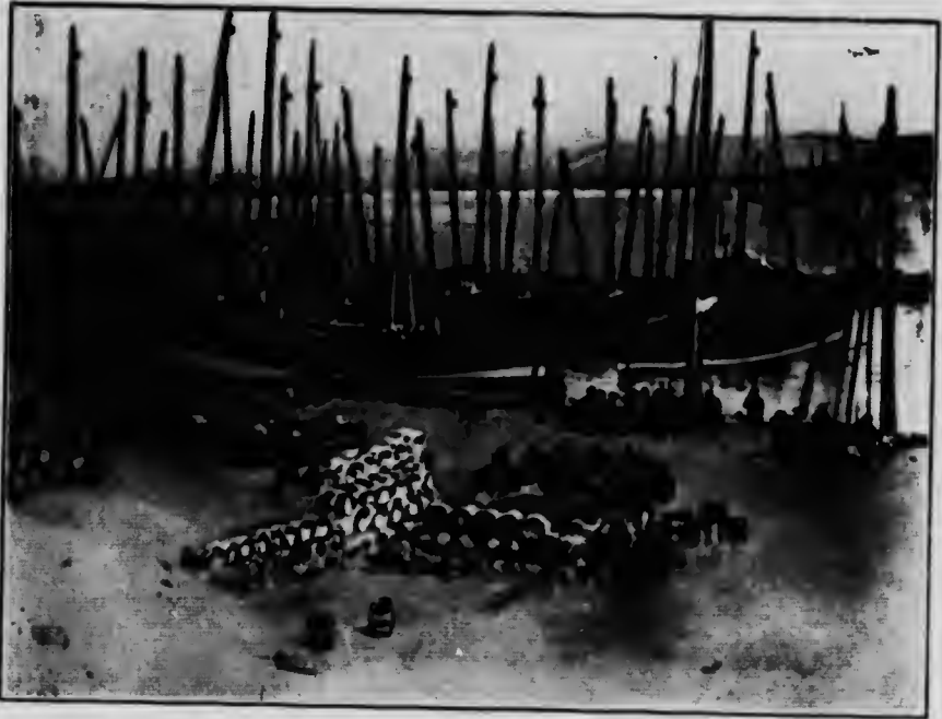
THE FISHING FLEET AND SEA FRONT AT STORNOWAY.

The northernmost of these groups is known as the Outer Hebrides, and under this name are embraced the island of Lewis, North and South Uist, Benbecula, Barra and numerous smaller islands.