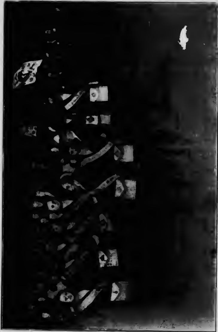
FREEMASONS OF FORTROSE LODGE, AND OTHERS, WHO WERE PRESENT AT THE LAYING OF THE FOUNDATION STONE OF STORNOWAY CASTLE, 1847—SEE P. 42.