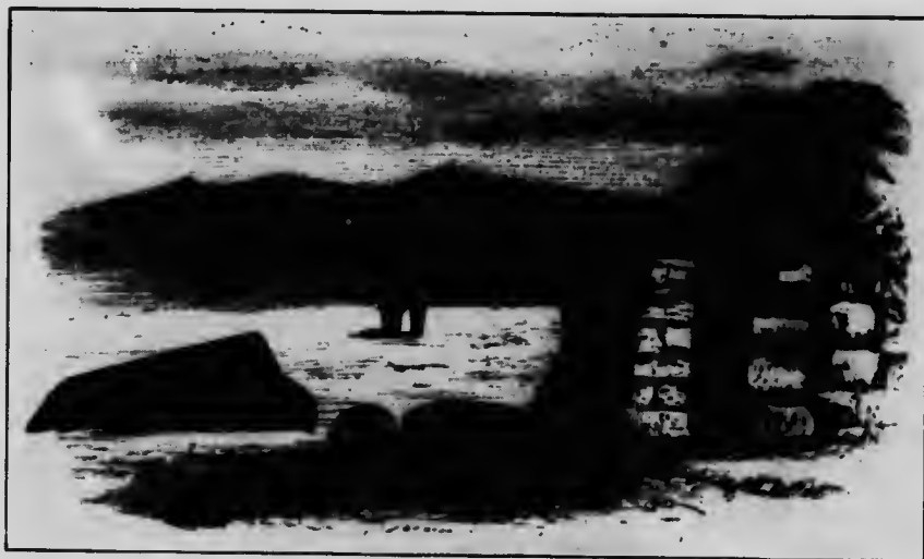
BEE-HIVE HUT NEAR LOCH BARVAS.

The tourist of antiquarian mind who visits The Lewis will find on the western side of the island at the head of Loch Roag, or about sixteen miles from Stornoway, the Druidic stones of Callernish, a "circle" more perfect than can be found elsewhere in the United