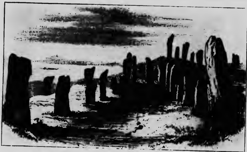
THE STONES OF CALLERNISH.