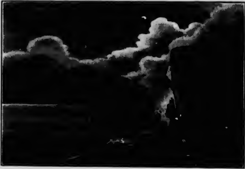
CANNA ONE OF THE WESTERN ISLANDS

The founding of the town is too remote for even surmise, beyond the belief that it was first settled by migrations from Norway, for Lewis had a connection centuries ago, through its trade with Bergen, with that northern country. The name is undoubtedly Norse, being derived from "Stor," signifying "Steep Peak," and