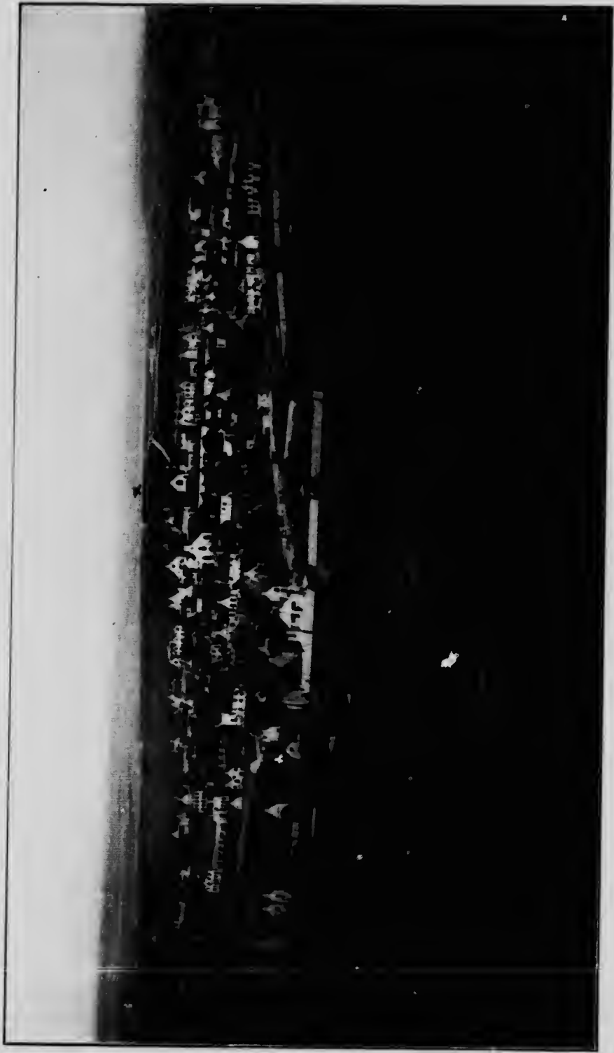
THE TOWN OF STORNOWAY, ON THE ISLAND OF LEWIS, 1905.