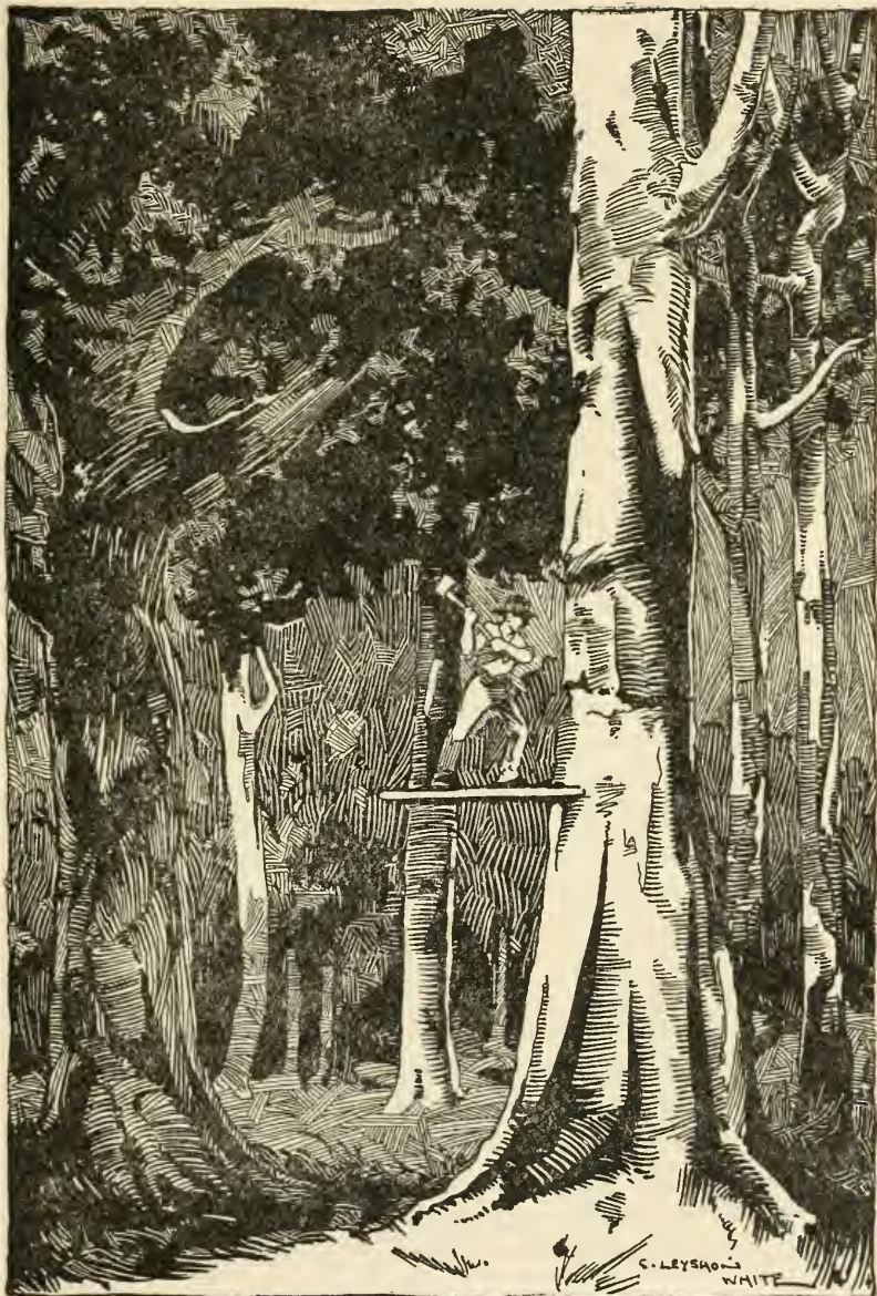
I went with them to where they were chopping.