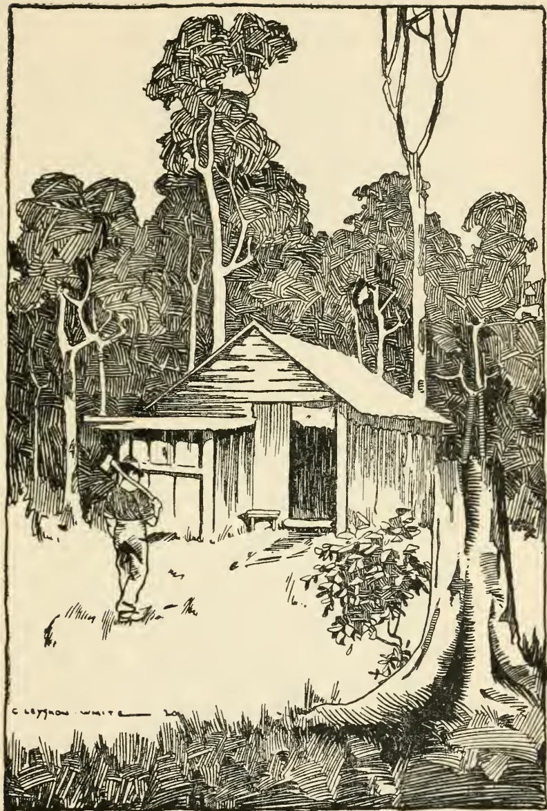
We had a really decent comfortable little house.