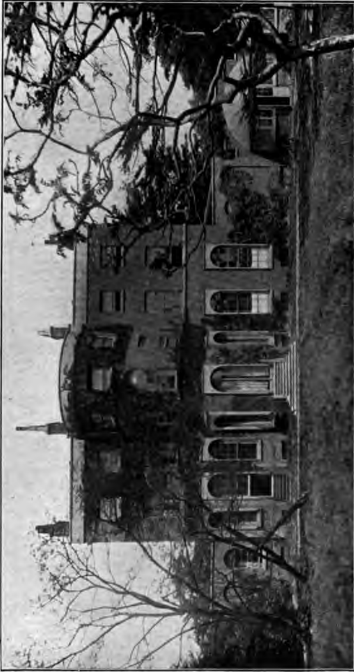
GRANT'S HOUSE AT CLAPHAM (NOW CARLYLE COLLEGE).