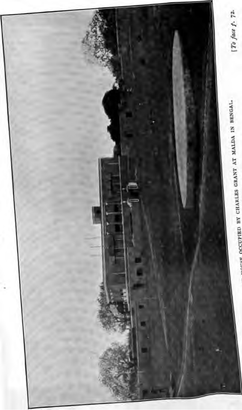
THE HOUSE OCCUPIED BY CHARLES GRANT AT MALDA IN BENGAL.