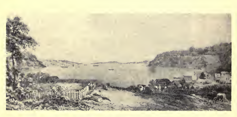
Port Chalmers in 1850.

To-day, Otago Harbour stretches from Taiaroa Head to Dunedin, with the Lower Harbour divided from the Upper Harbour by the submerged divide, once two green hills.