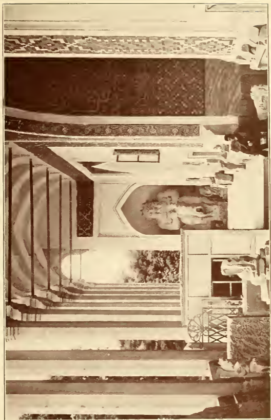
VESTIBULE IN THE PALACE OF FAIENCES