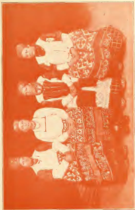
TYPES OF RUSSIAN WOMEN