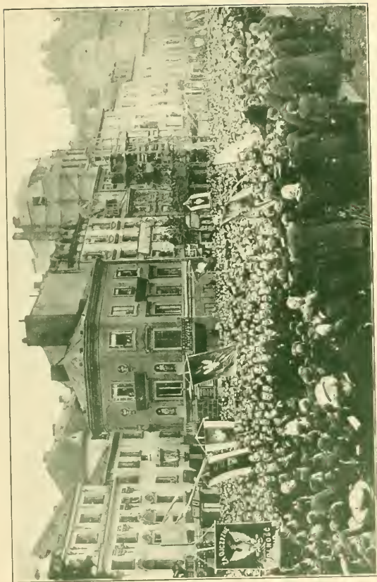
A PROCESSION OF TERRORISTS CARRYING THE RED FLAG THROUGH THE STREETS OF WARSAW