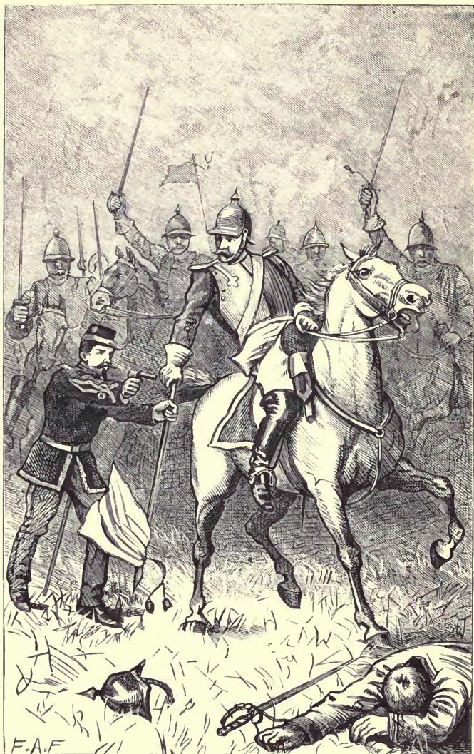
“In the mêlée that ensued a French infantry officer seized the staff.”—p. 73