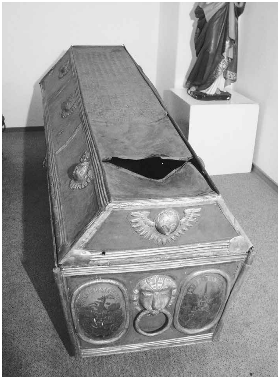
Figure 2: John Gunn's sarcophagus.