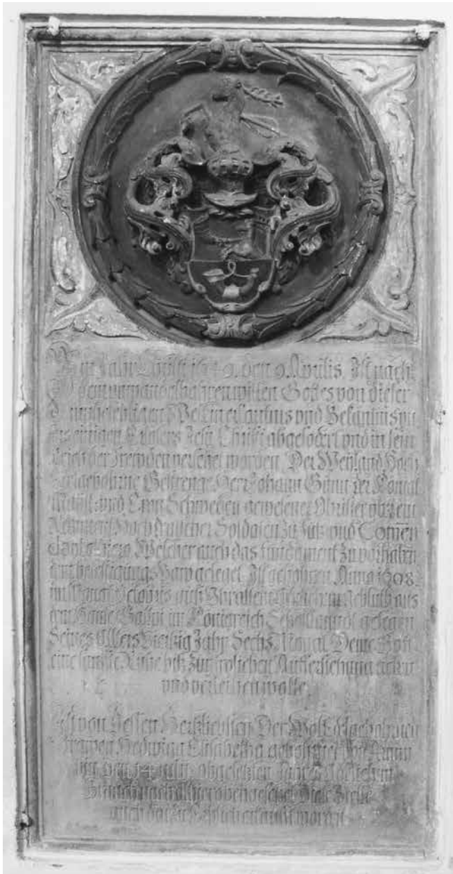
Figure 1: John Gunn's epitaph.