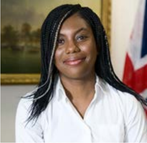
The Rt Hon Kemi Badenoch MP Secretary of State for Business and Trade, President of the Board of Trade, Minister for Women and Equalities

In the face of global instability, the headwinds of COVID and Putin’s invasion of Ukraine, the UK’s economic performance has defied all expectations.