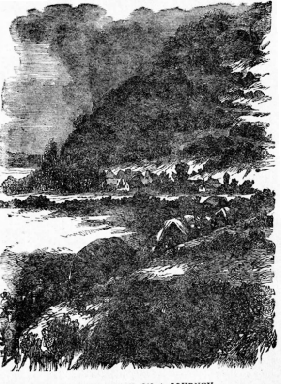
BULLOCK TRAIN ON A JOURNEY.