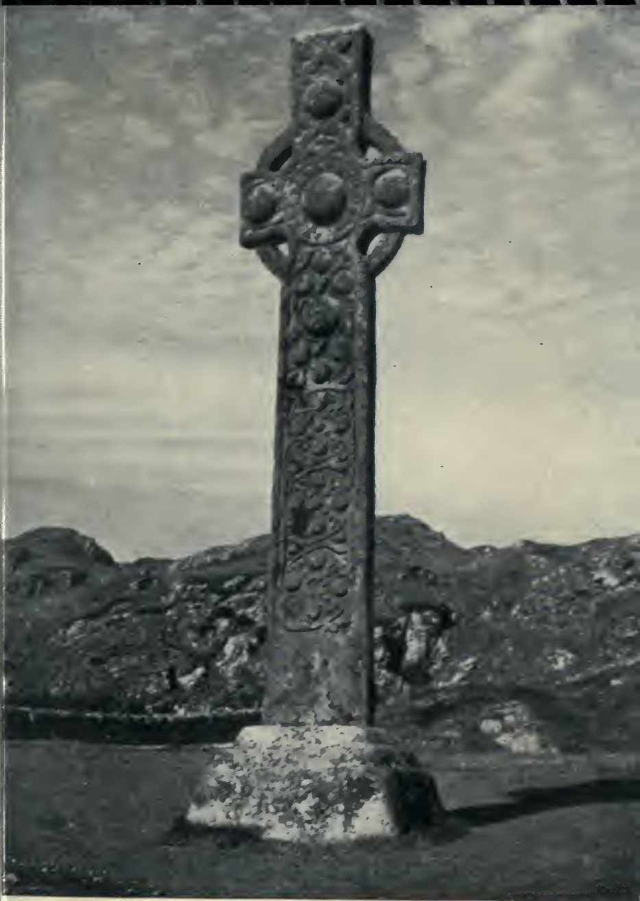
c• St. Martin's Cross (10th century)