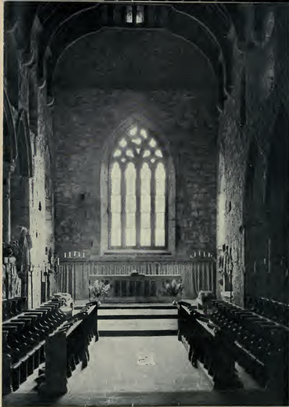
Choir and Chancel