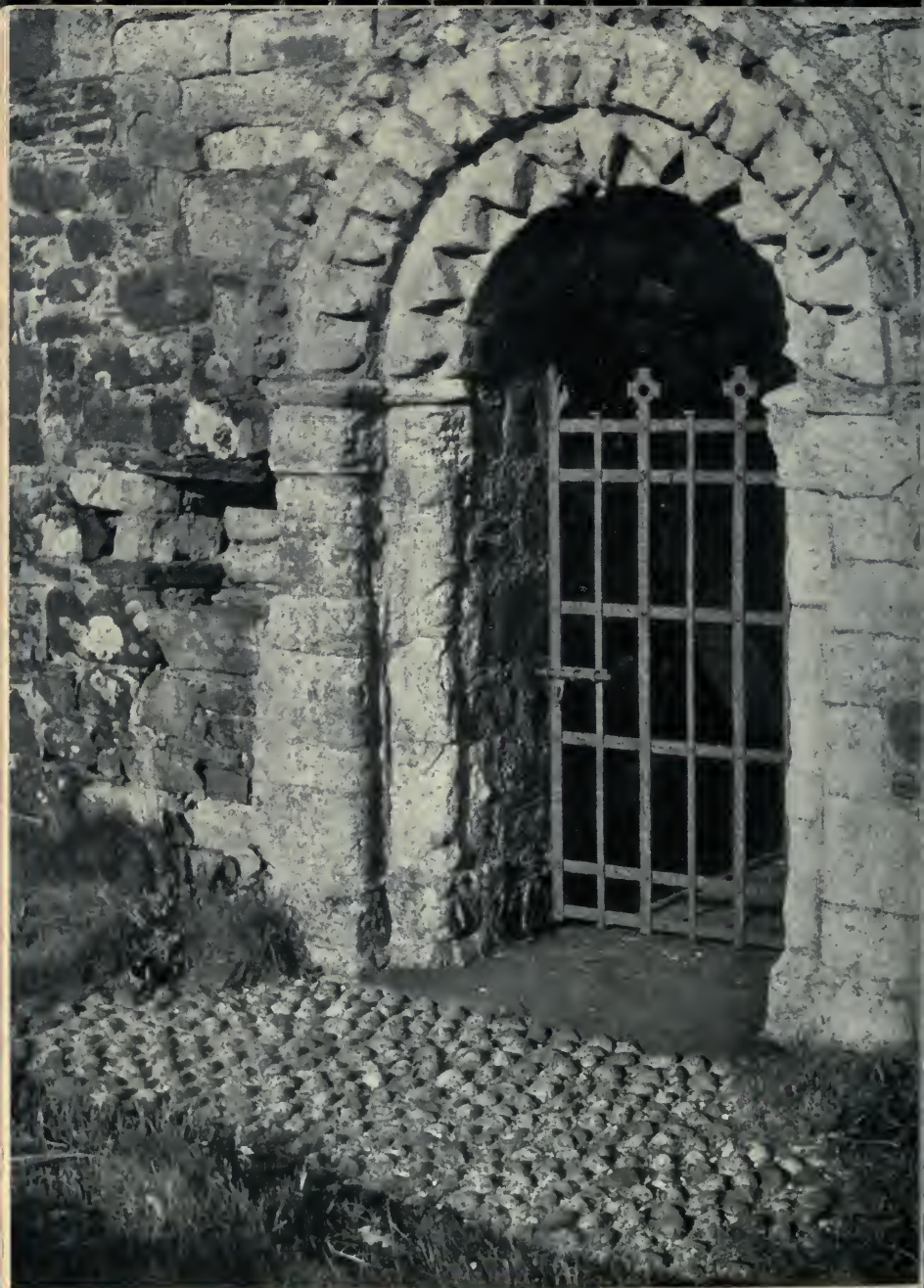
Norman Doorway of St. Oran's Chapel in Reilig Oran ; The Burial Place of the Kings