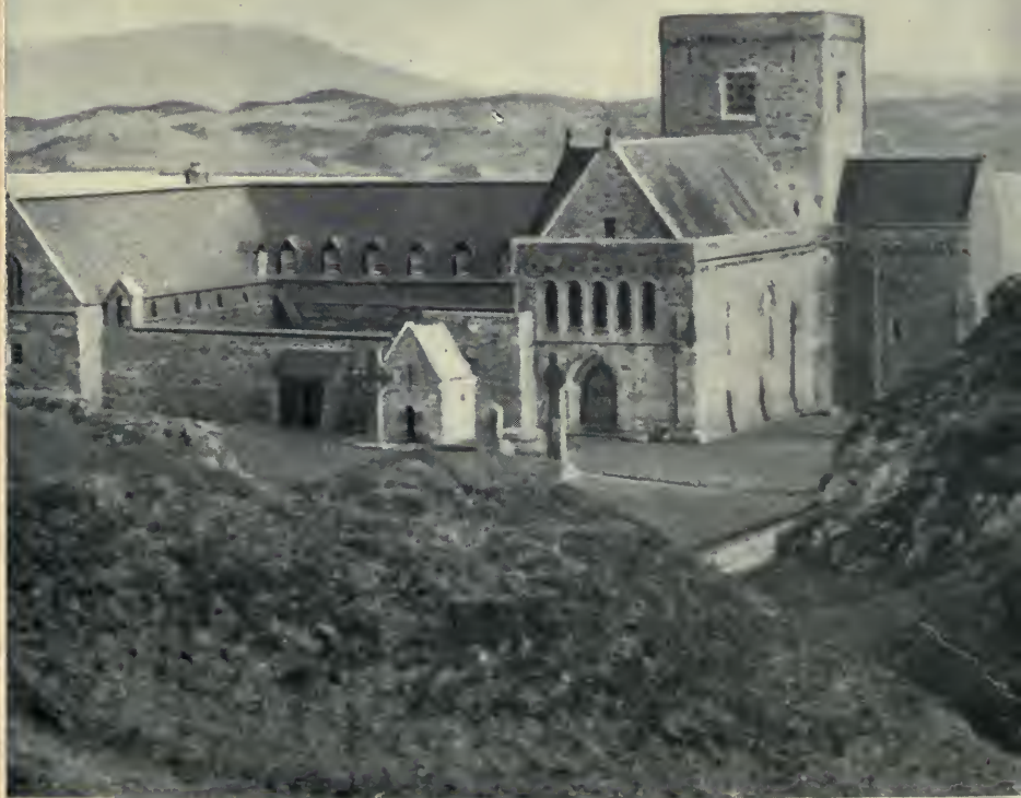
Abbey Church of St. Mary and Monastery buildings