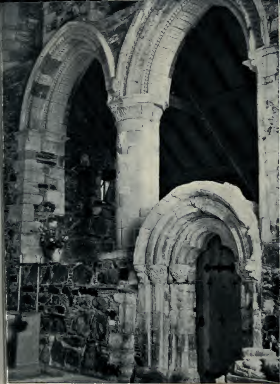
Sacristy Door and Arches