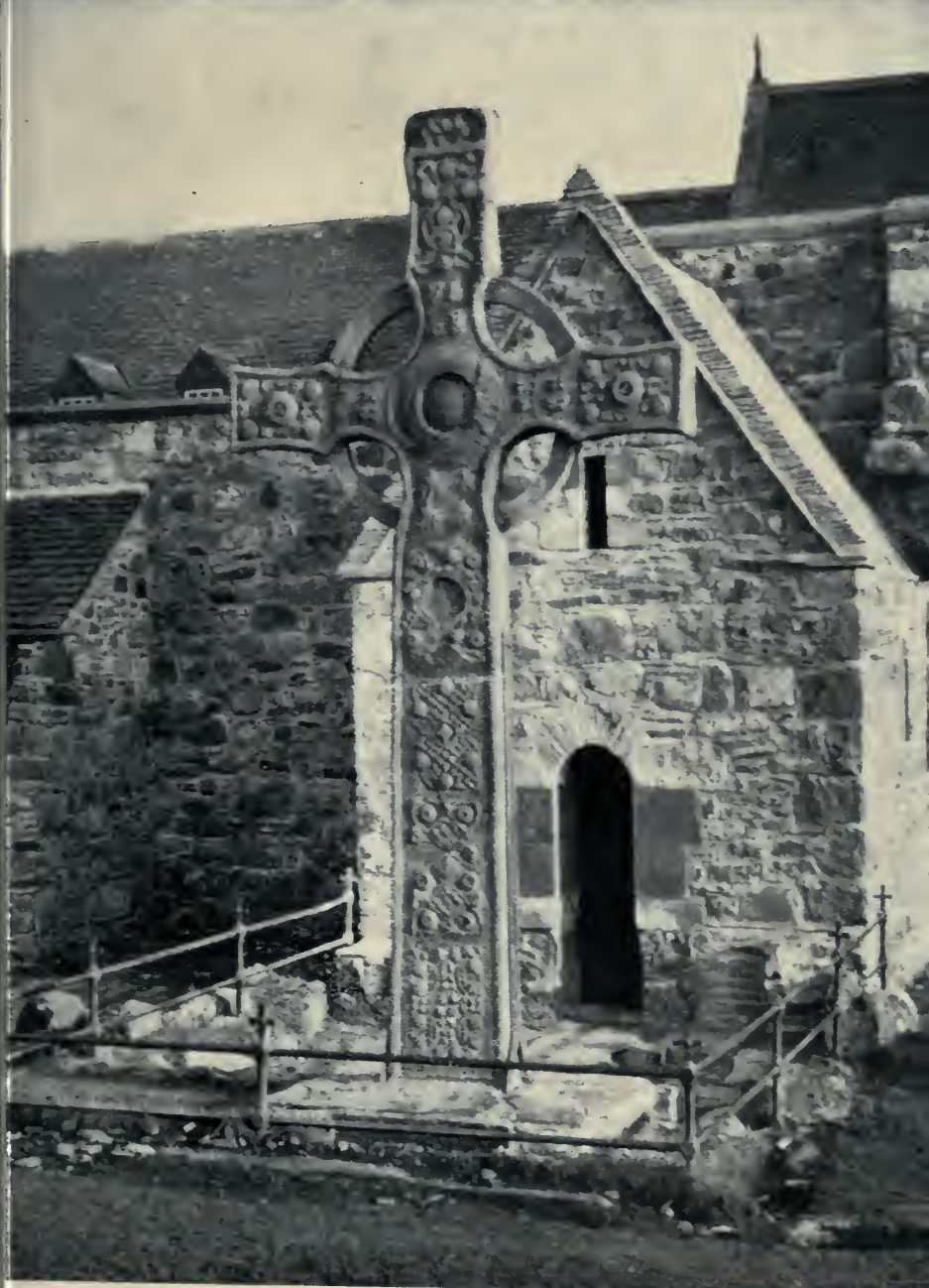
St. John's Cross (10th century)