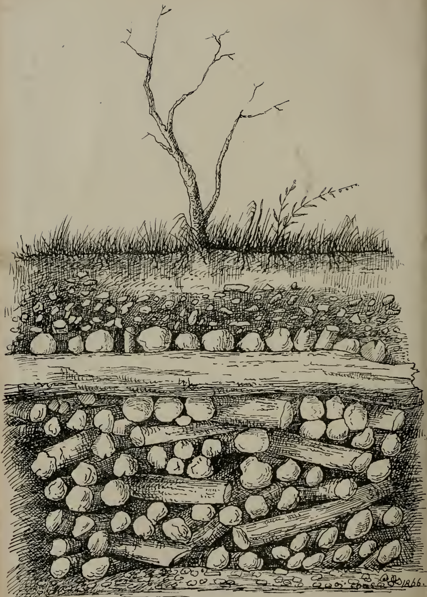
Section of Crannog, Black Loch, Sanquhar.