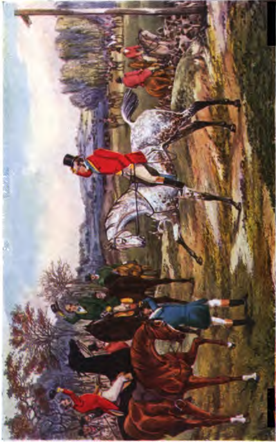
H. Alken, del.