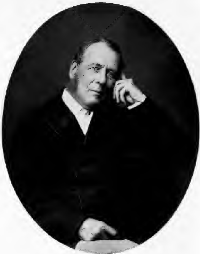
MR. SERJEANT BALLANTINE.