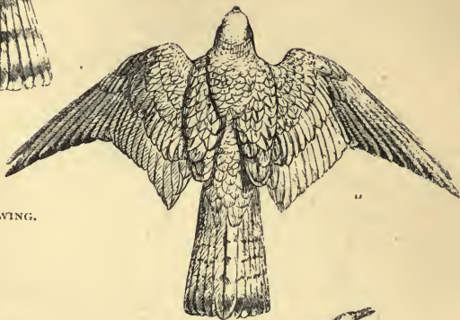
B. MERLIN—SHARP WING.