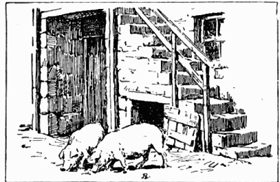
SWINE IN EDINBURGH STREETS

"12th May, 1451. Aitkyne, barbi tonsor, effectus est burgensis ad instantiam domine Regine gratis datur et etiam conceditur sibi [blank] gilde pro tempore vite sue et in amplius vt possit vti libertate gilde tempore vite sue, soluendo species et vinum nusquam est sibi successurus post obitum ad libertatem gilde.