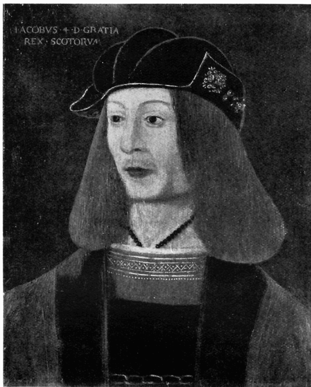
KING JAMES IV. (1473-1513)

Lindesay of Pitscottie records a case which illustrates James's curiosity in matters of physiology. A man child was born with two bodies from the waist upwards. The King caused him to be carefully brought up and taught, and he lived to the age of twenty-eight years. One body, it is said, died long before the other, to the great grief of the survivor.