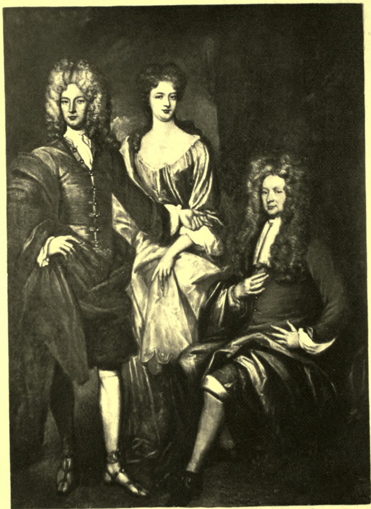
George, 1 st Duke of Gordon, seated with his son Alexander, Marquis of Huntly and daughter Jane, Duchess of Perth.