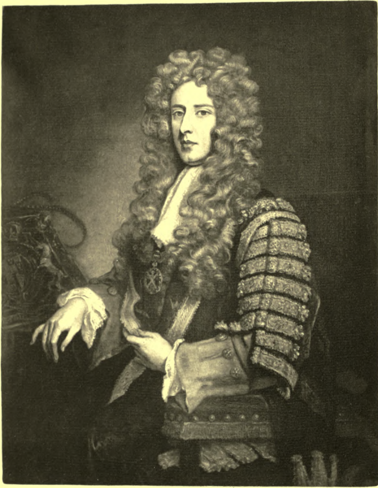
James 1 st Earl of Seafield. Lord High Chancellor of Scotland. BY SIR GODFREY KNELLER.