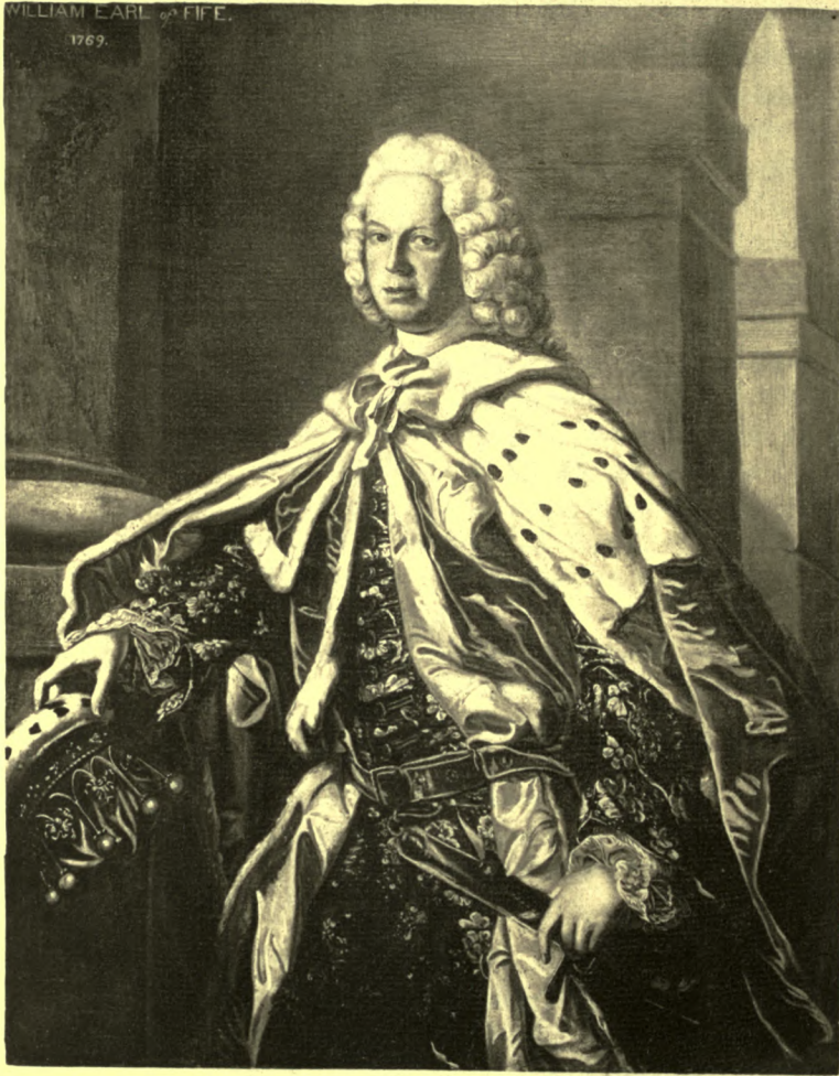
William Duff, Lord Braco and 1 st Earl of Fife.