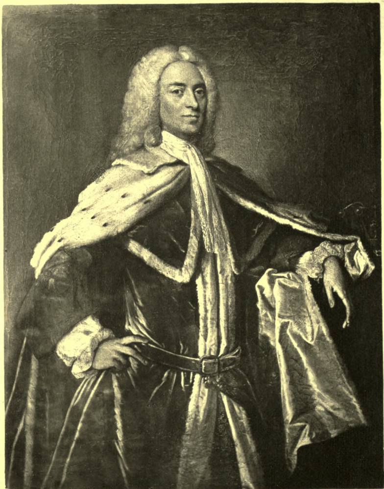
James, 5 th Earl of Fendlater and 2 nd Earl of Seafield.