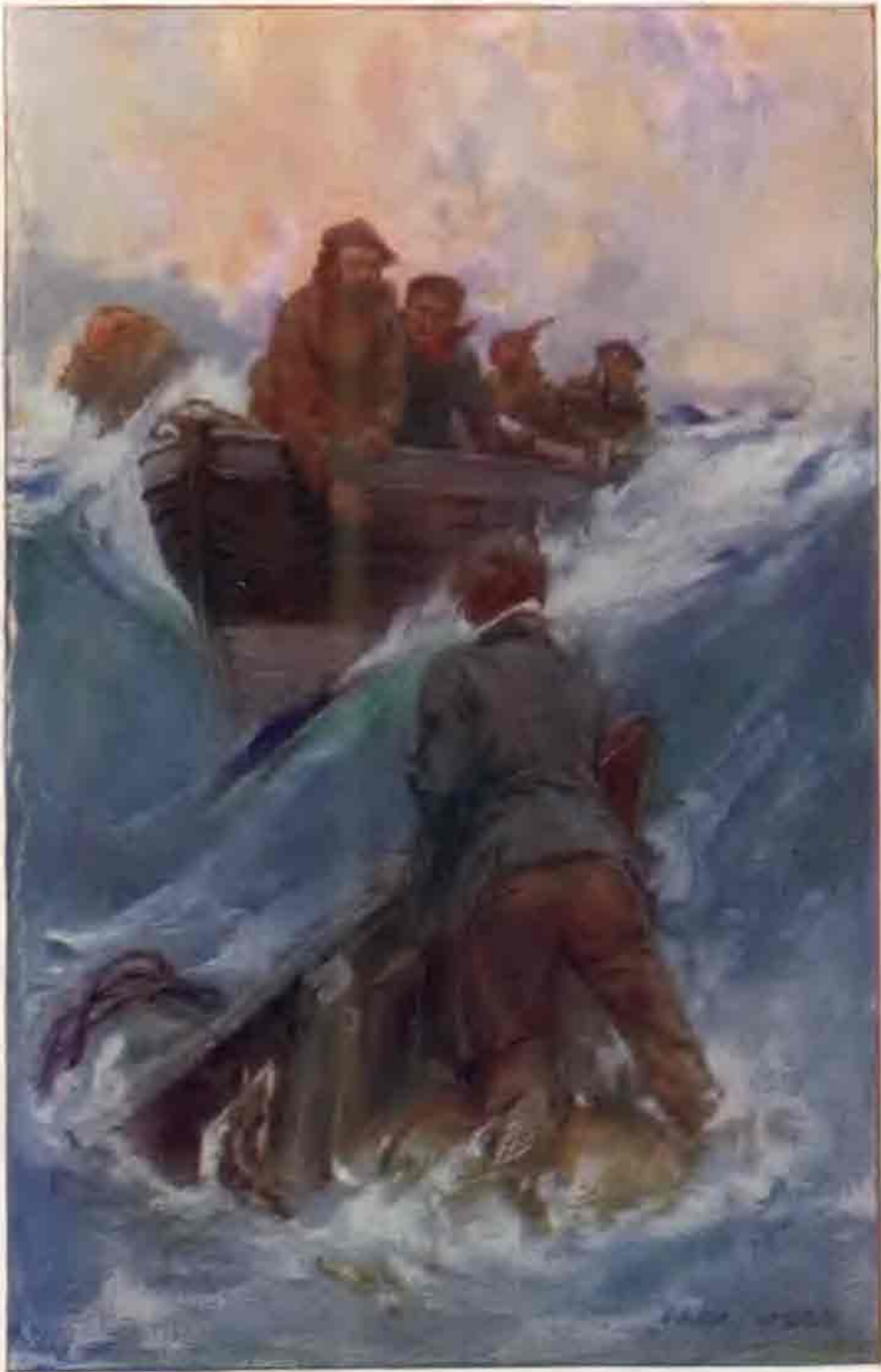
"STAND BY TO LEAP ABOARD!"