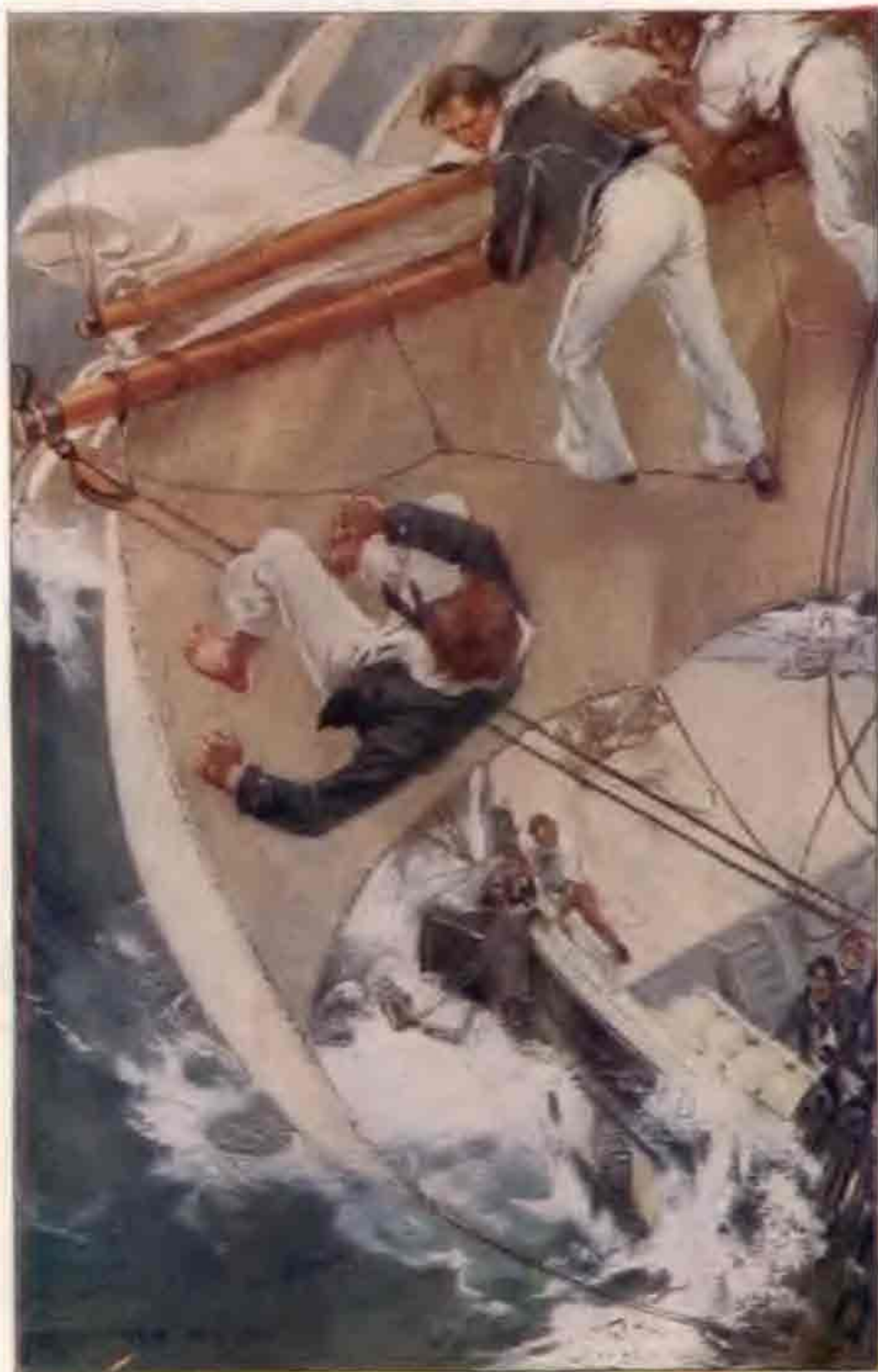
"I FOUND MYSELF FALLING INTO THE SEETHING OCEAN." [See page 228.]