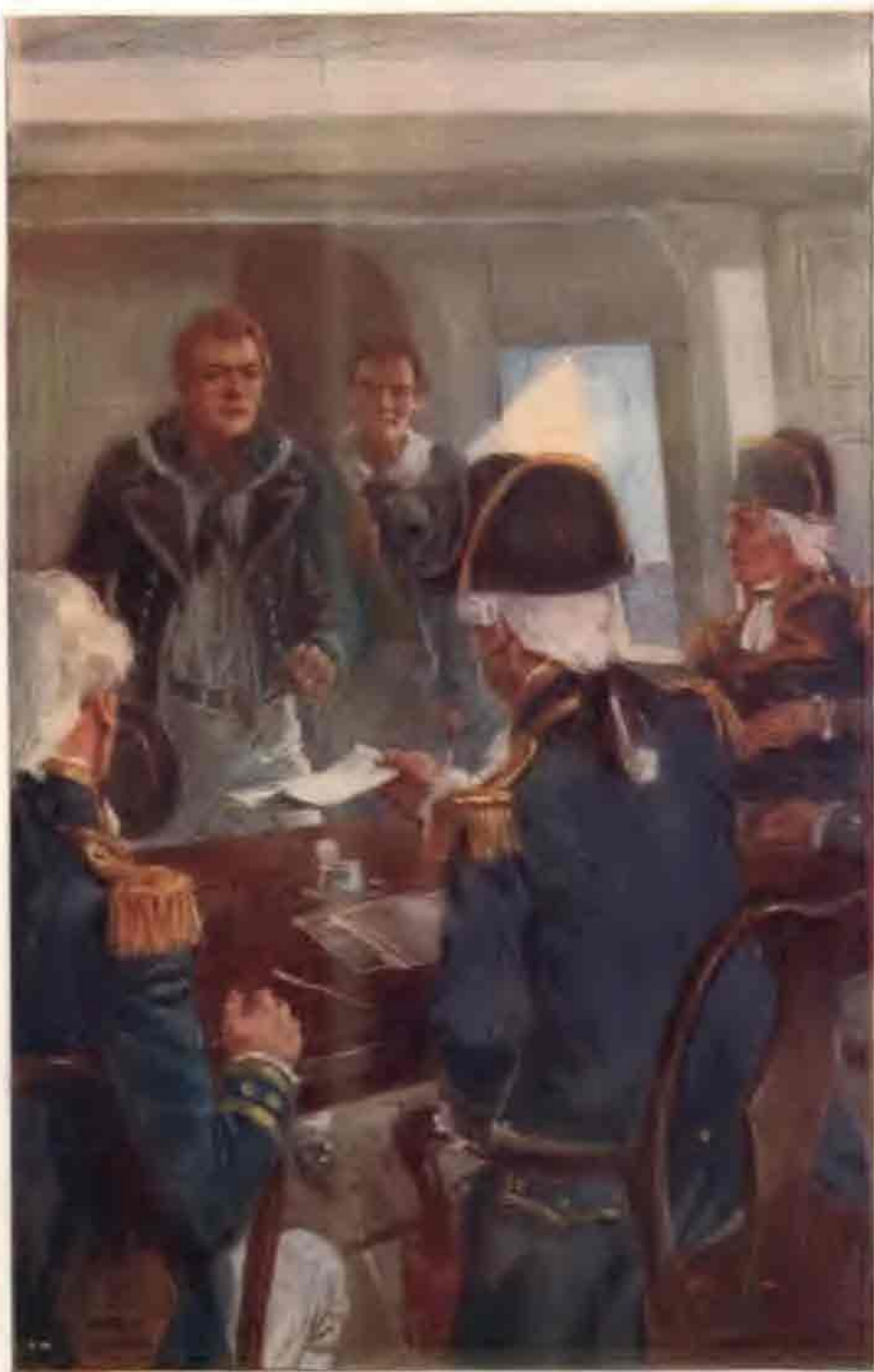
"CAN YOU SWEAR THAT THIS IS NOT YOUR SIGNATURE?"