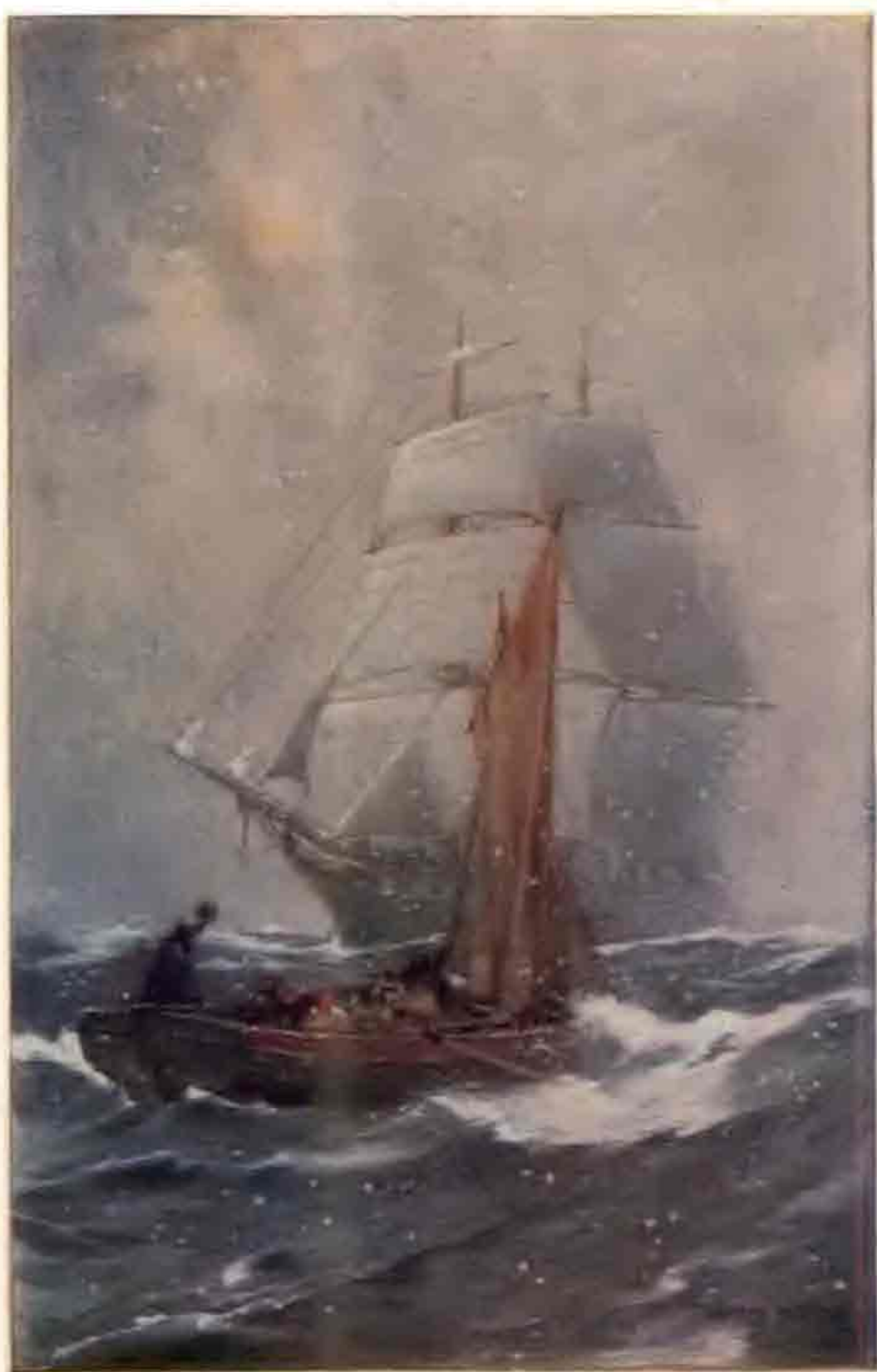
"THE DARK HULL AND WIDE-SPREADING SAILS OF A SHIP BROKE ON OUR SIGHT."