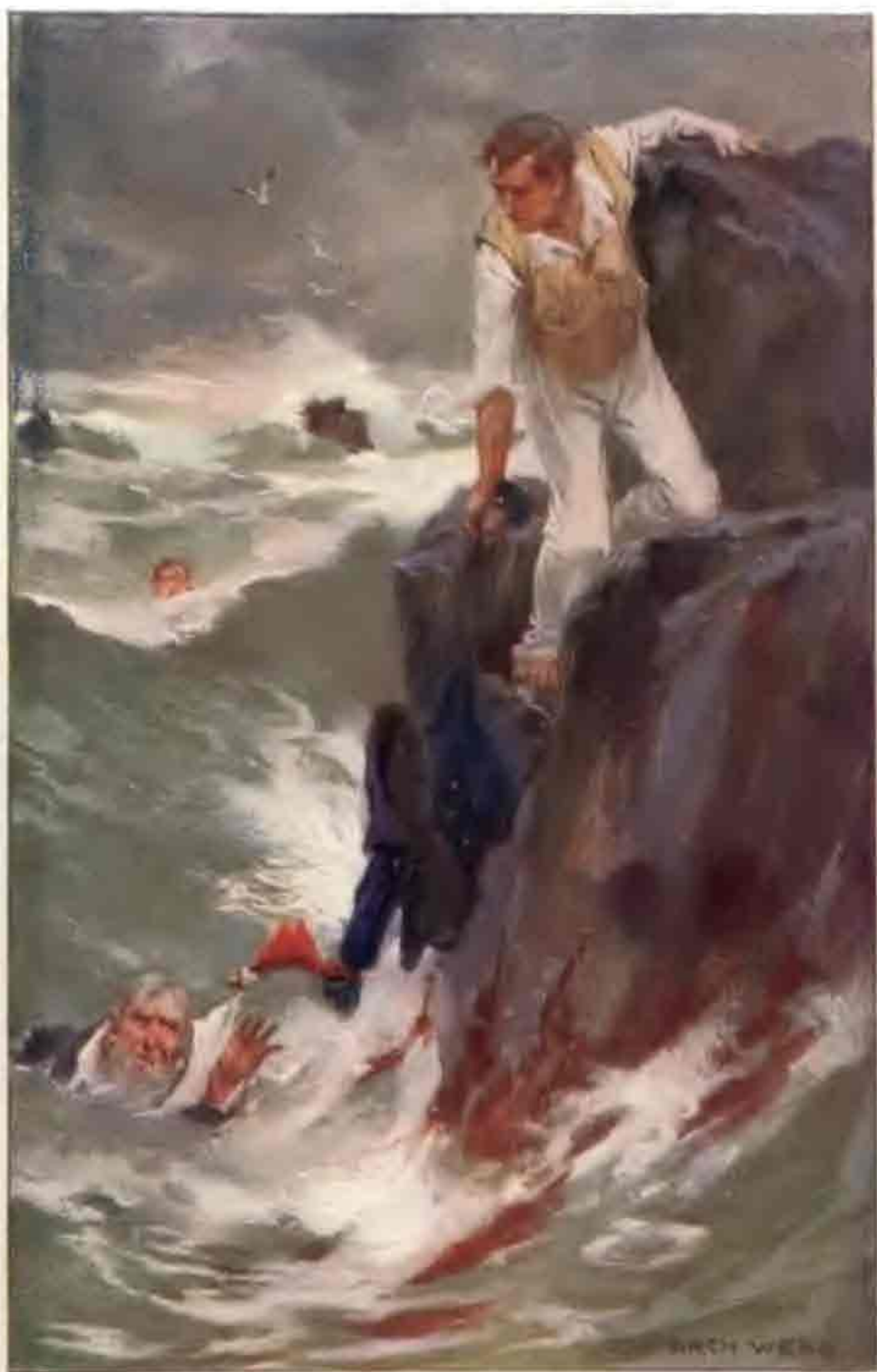
"THEN I LOWERED THE HANDKERCHIEFS, AND HE CAUGHT HOLD OF THEM."