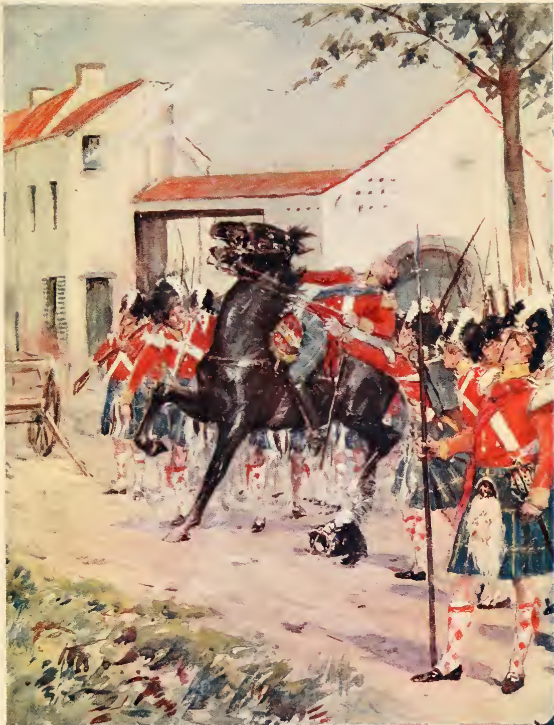
THE GORDONS AT QUATRE BRAS