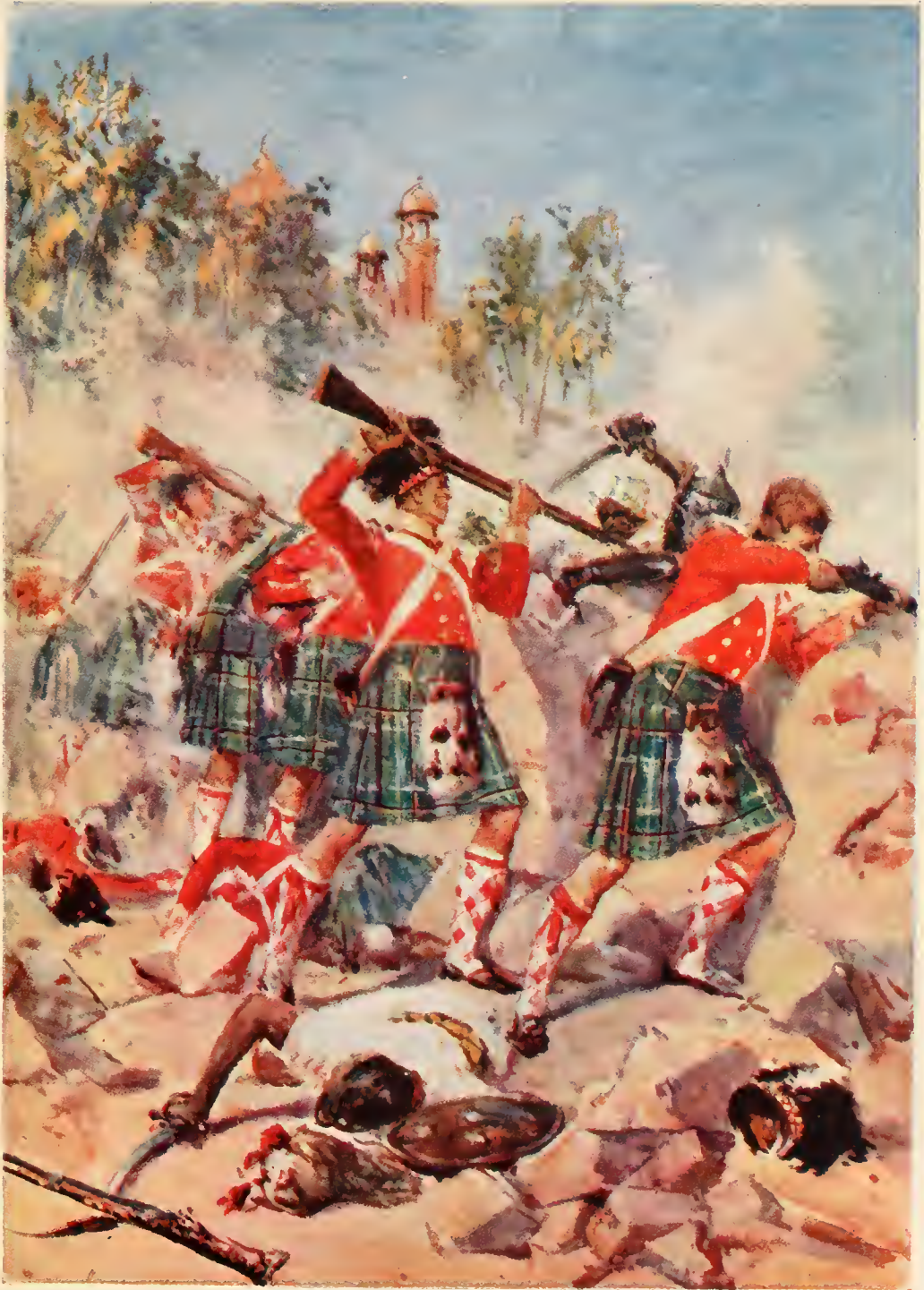
THE HIGHLAND LIGHT INFANTRY AT SERINGAPATAM