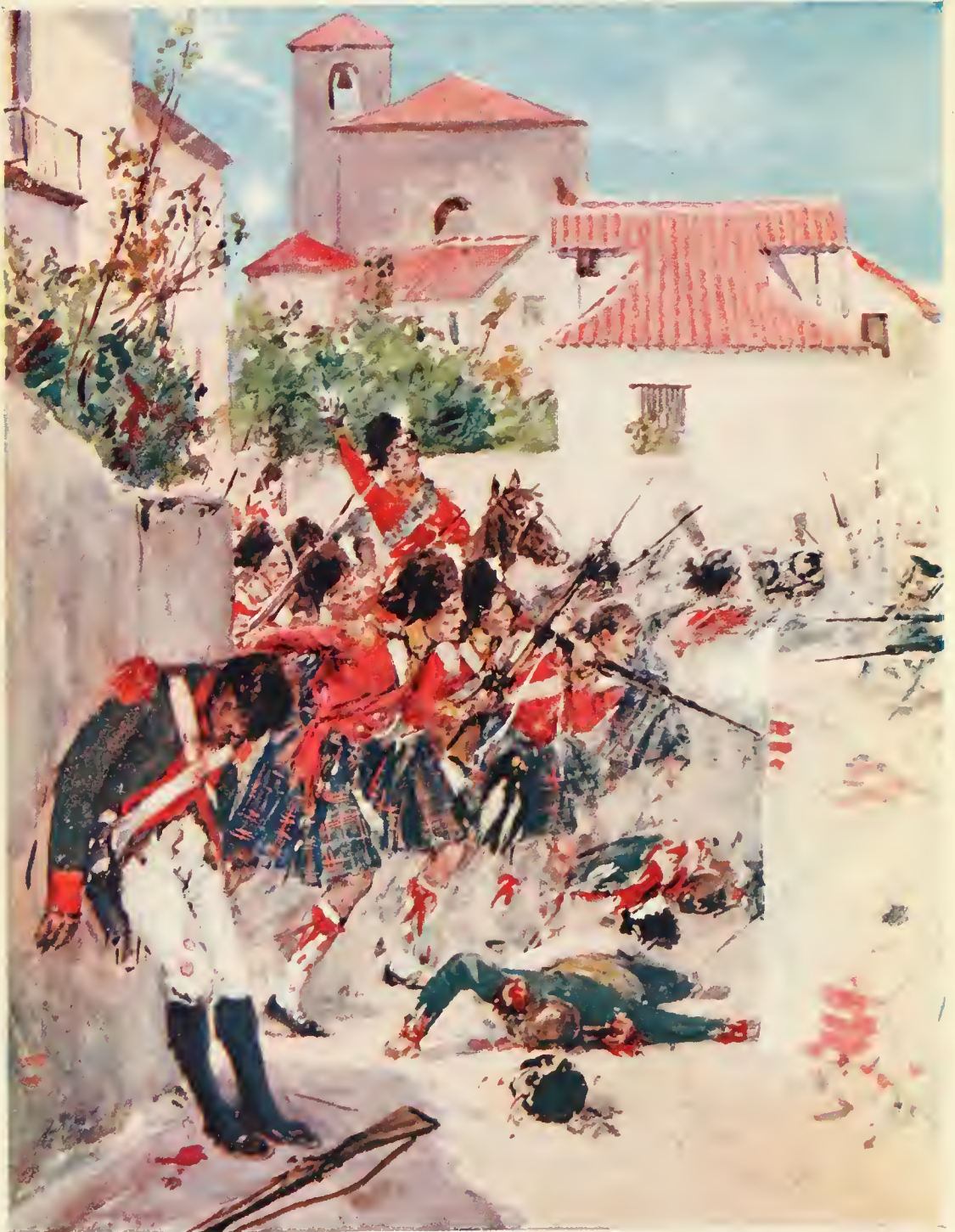
THE CAMERONS AT FUENTES DE ONORO