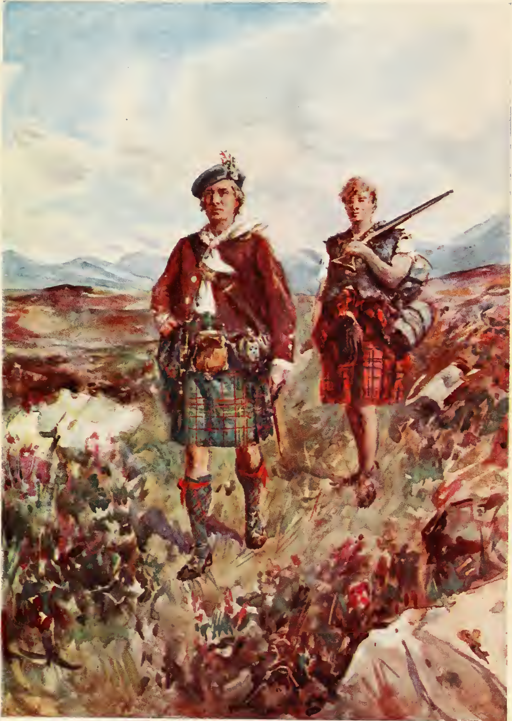
A HIGHLAND CHIEF