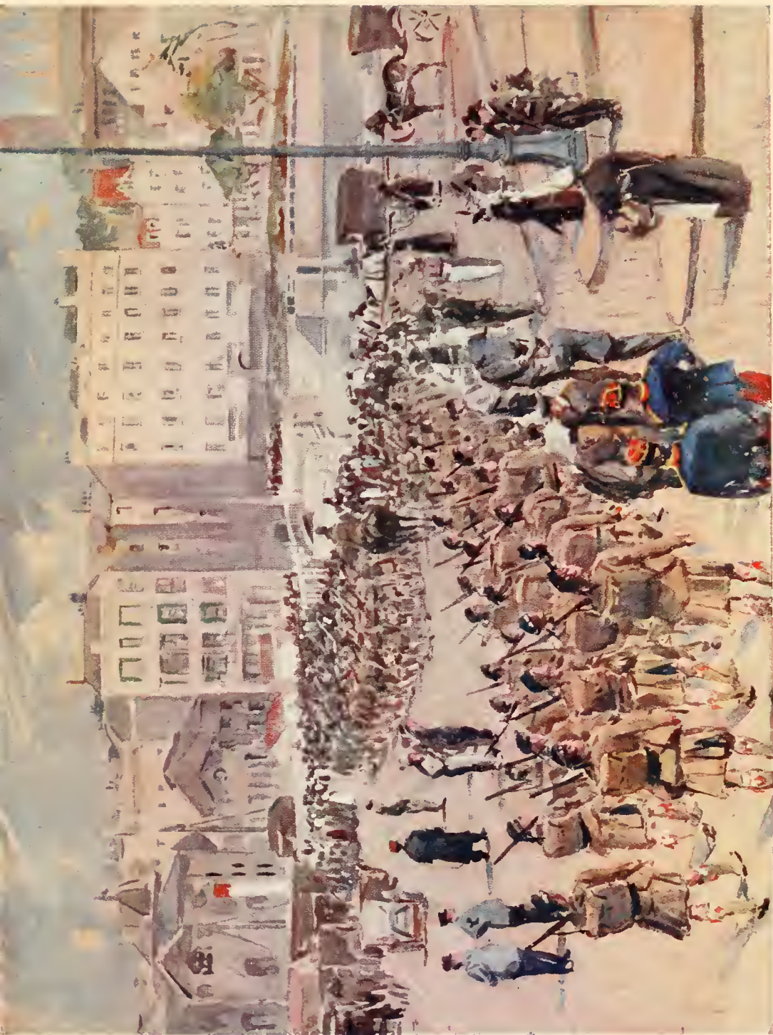
THE ARGYLL AND SUTHERLANDS ENTERING BOULOGNE, AUGUST 1914