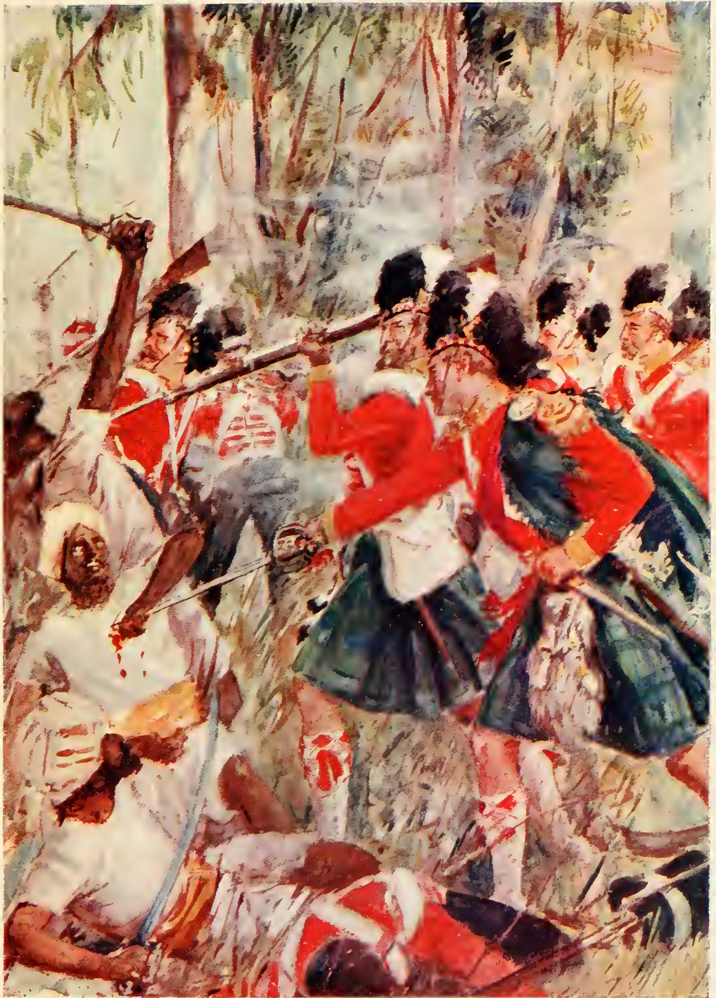
THE SUTHERLAND HIGHLANDERS AT LUCKNOW