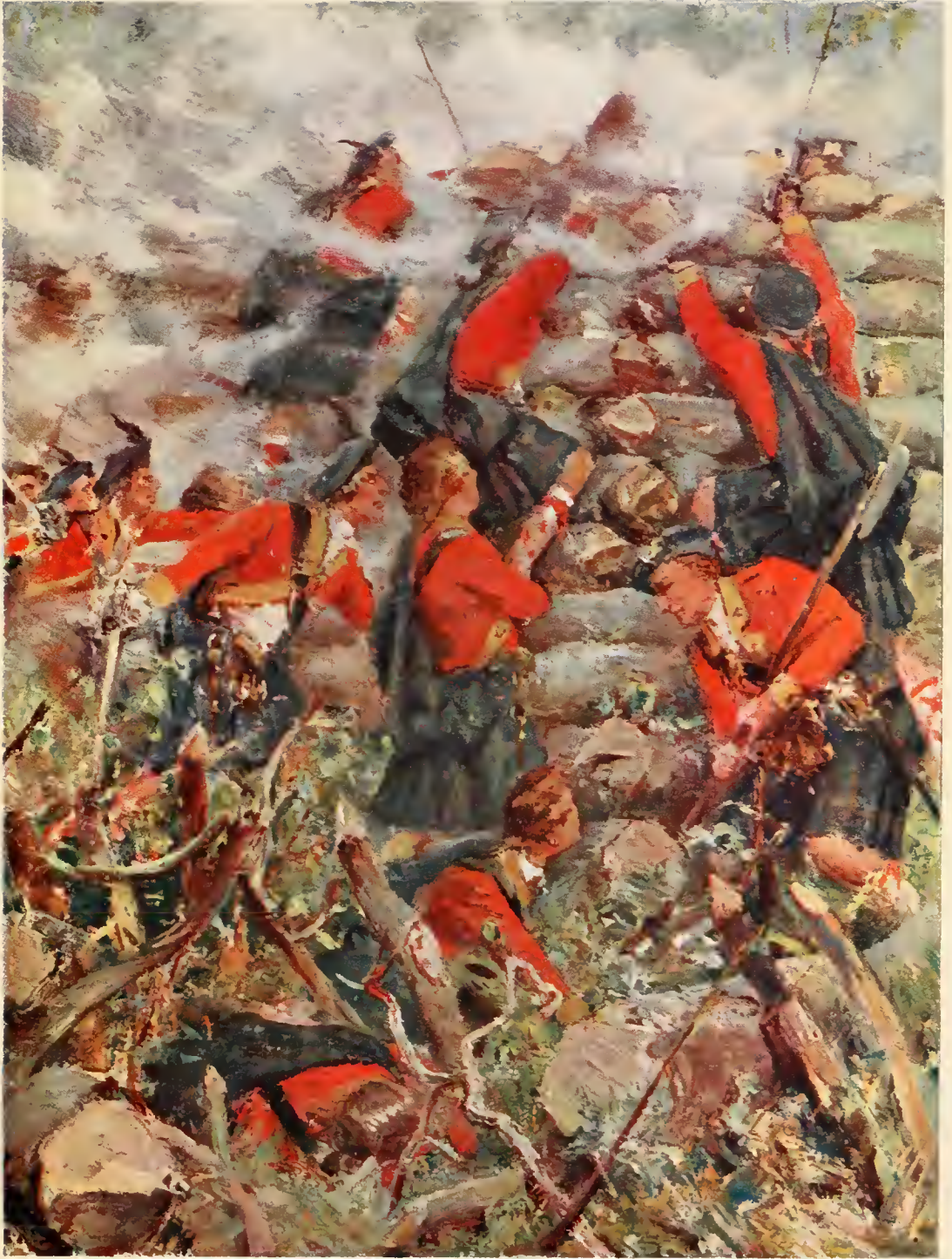
THE BLACK WATCH AT TICONDEROGA