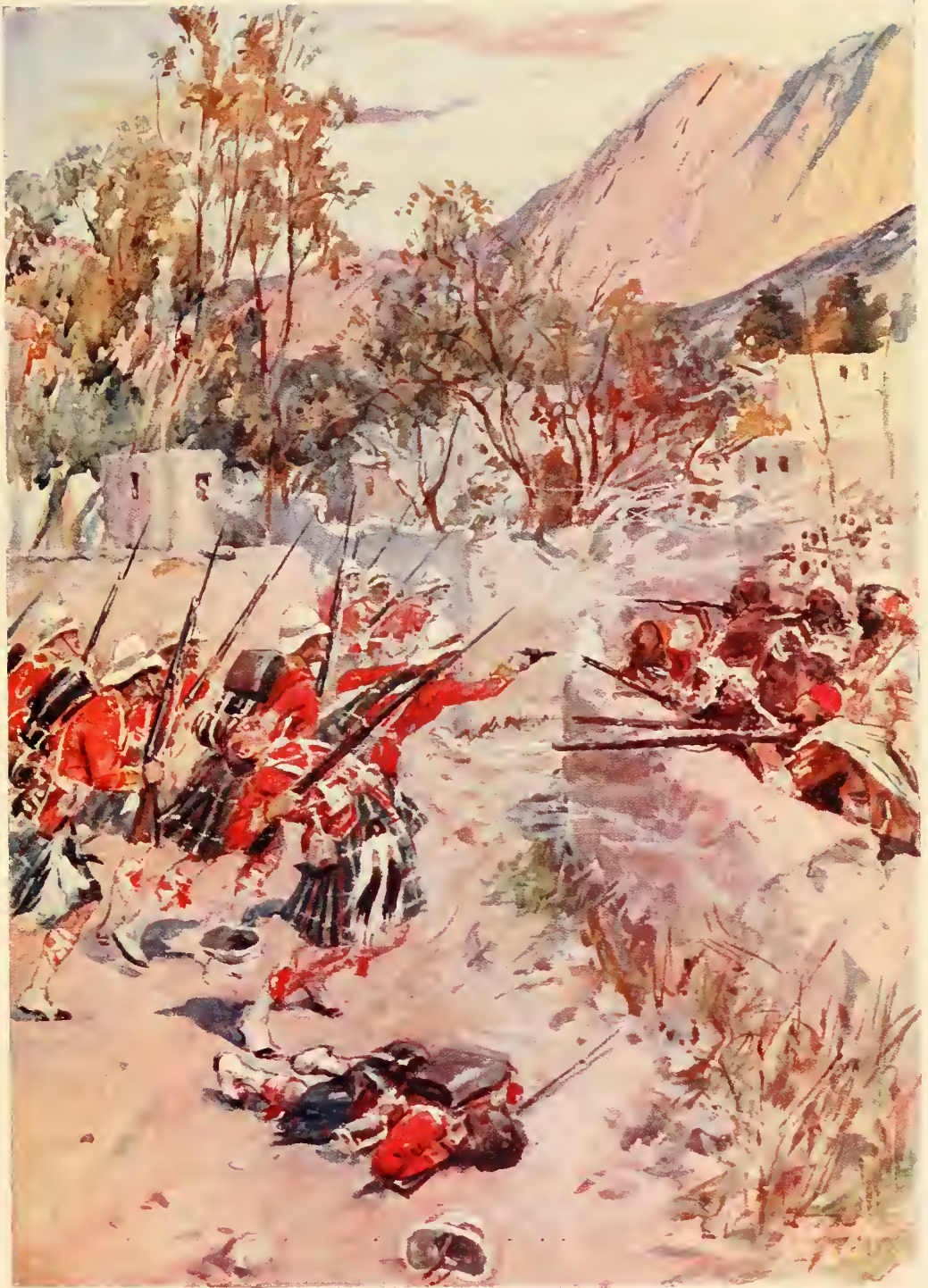
THE SEAFORTHS AT CANDAHAR