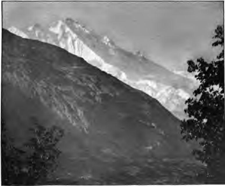
RAKAPUSHI FROM HUNZA.