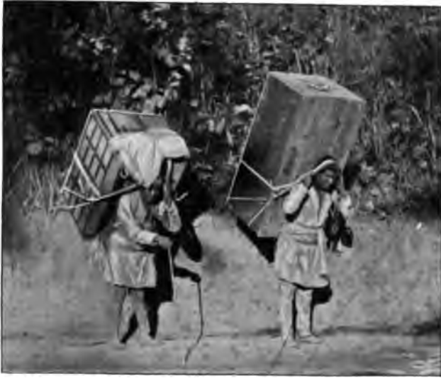
GOORKHA LOAD CARRIERS.