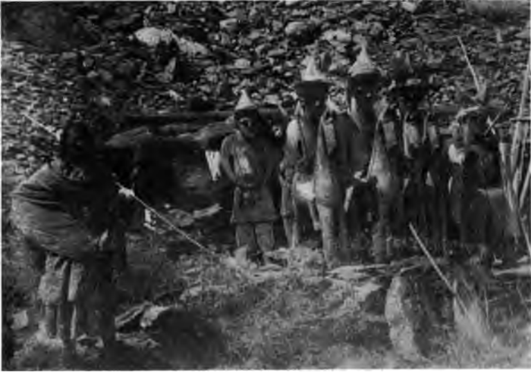
KAFIR EFFIGIES OVER GRAVES.