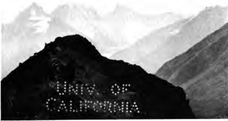
UPPER NAGYR WITH GOLDEN PARI IN DISTANCE.