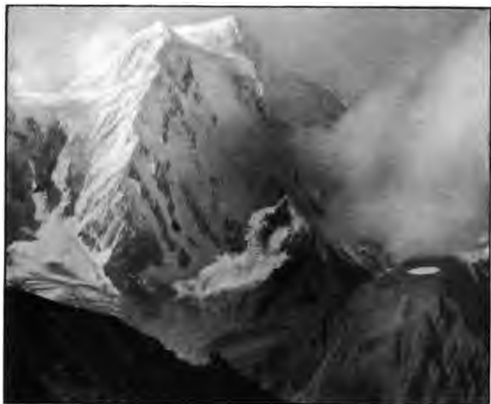
THE CHONGRA PEAKS FROM THE NORTH.