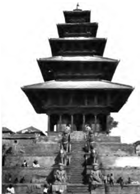
TEMPLE IN BHATGAON.