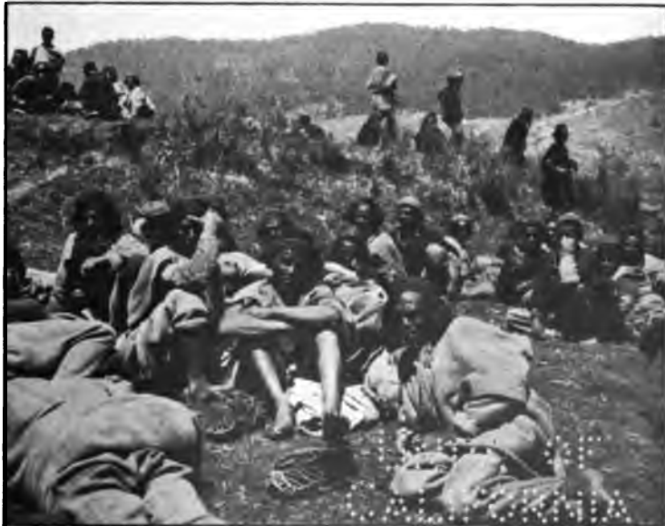
GARHWAL COOLIES. GRASSHOE OR 'SHAVEL.'