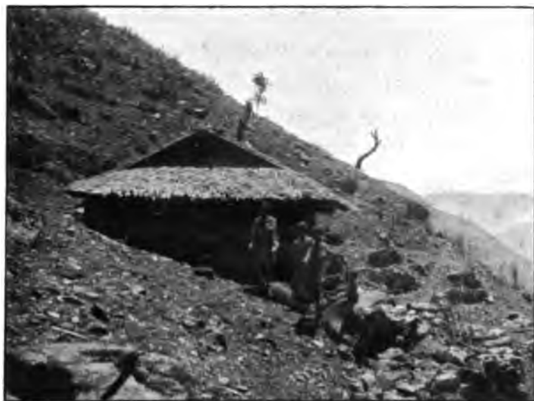
LIMBU HOUSE WITH BURNT HILLSIDE.