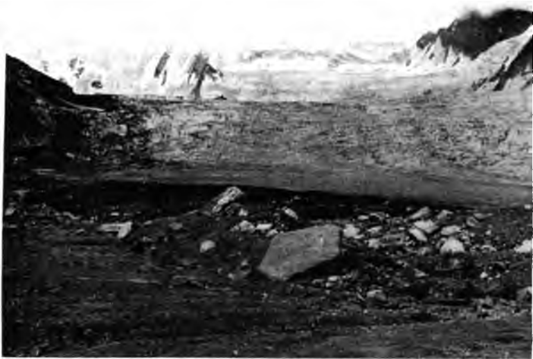
ROAD TO THE BHOT KHOL PASS LEFT OF PICTURE. VIEW OF OUR 'GYMKHANA' GROUND AND ICEFALL WE CAME DOWN.