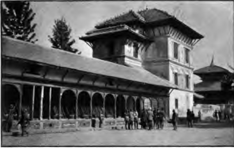
OLD DURBAR AND GUARD HOUSE, KHATMANDU.