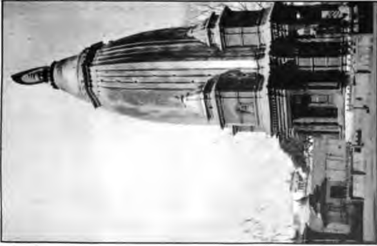
TEMPLE OF NARAYAN, KHATMANDU.