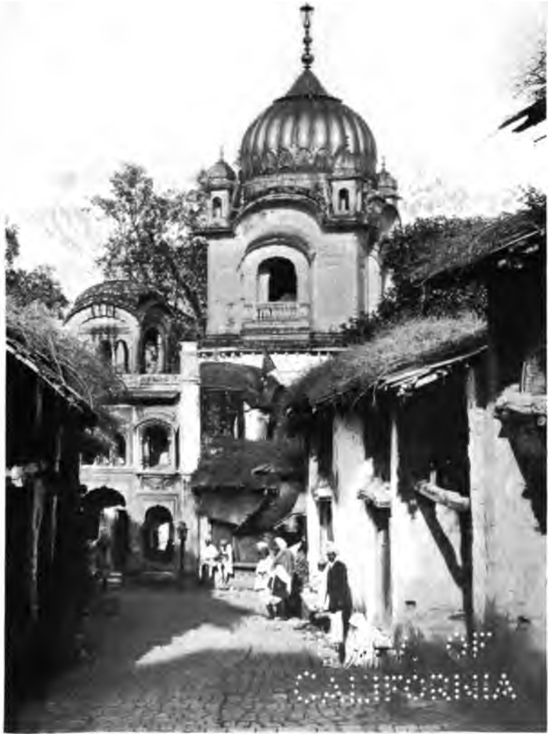
GOLDEN TEMPLE, KANGRA, AS IT WAS BEFORE THE EARTHQUAKE.