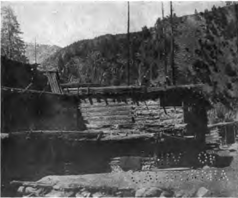
KAFIR VILLAGE, BIMBORET.