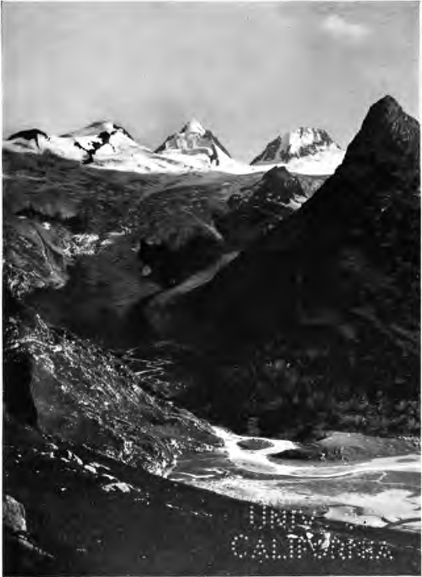
KOHENAR PEAKS FROM NEAR SHEESHA NĀG.