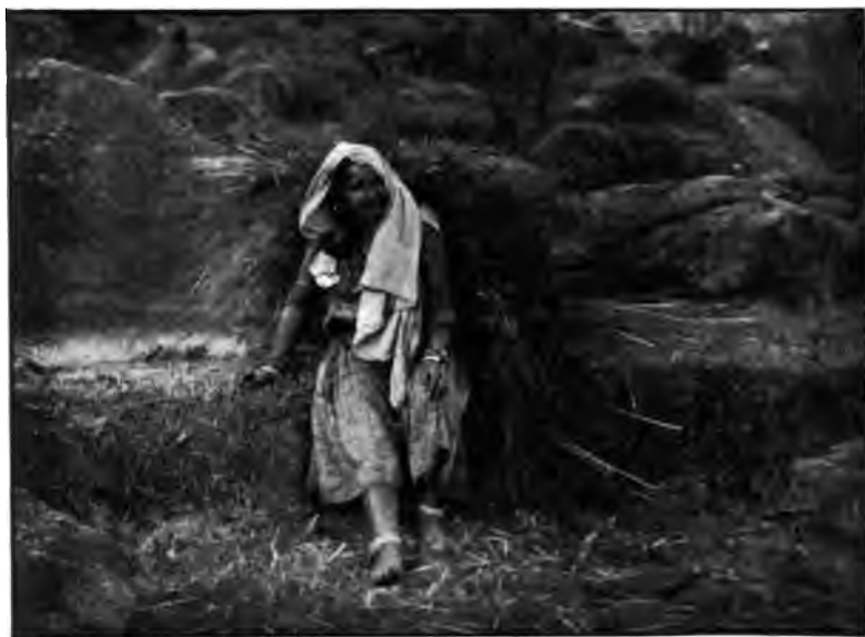
RICE HARVESTER, KANGRA VALLEY.