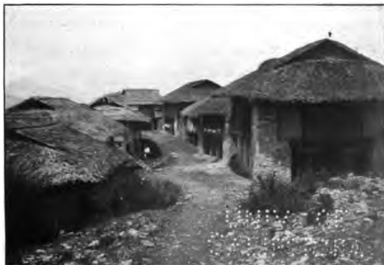
LIMBU VILLAGE OF TINGLING.