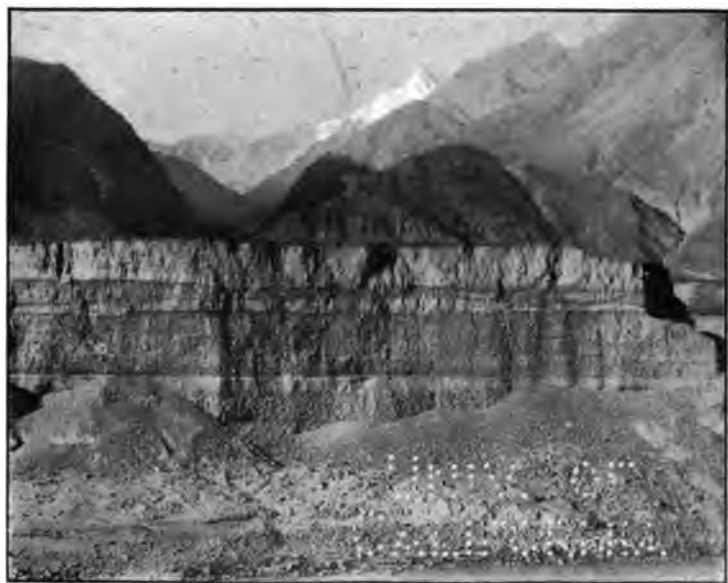
GILGIT RIVER BANK ENTRANCE TO BAGROTE NULLAH WITH MT. DEOBUNNI.