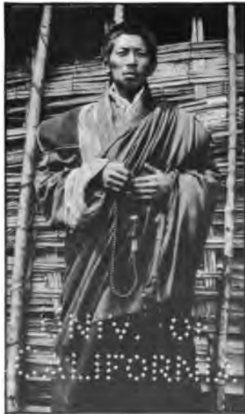
THE CHIMSERA LAMA, SIKKIM.