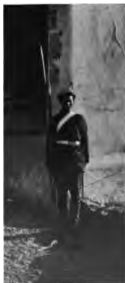
SENTRY AT CHISSAGARHI.