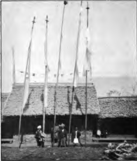
A PUBLIC HOUSE, SIKKIM.