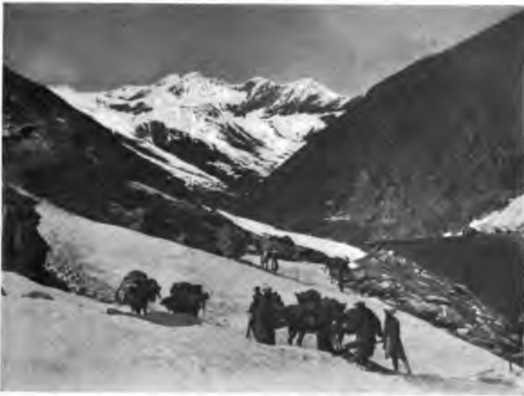
MULES IN UPPER KAGHAN.