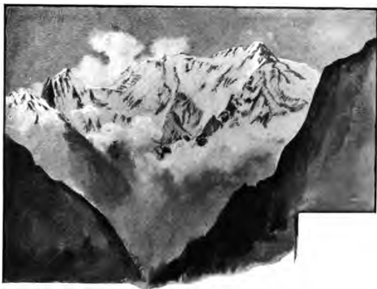
BOIOHAGHURDOOANASUR : HUNZA.