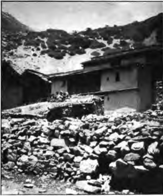
VILLAGE OF NITI.