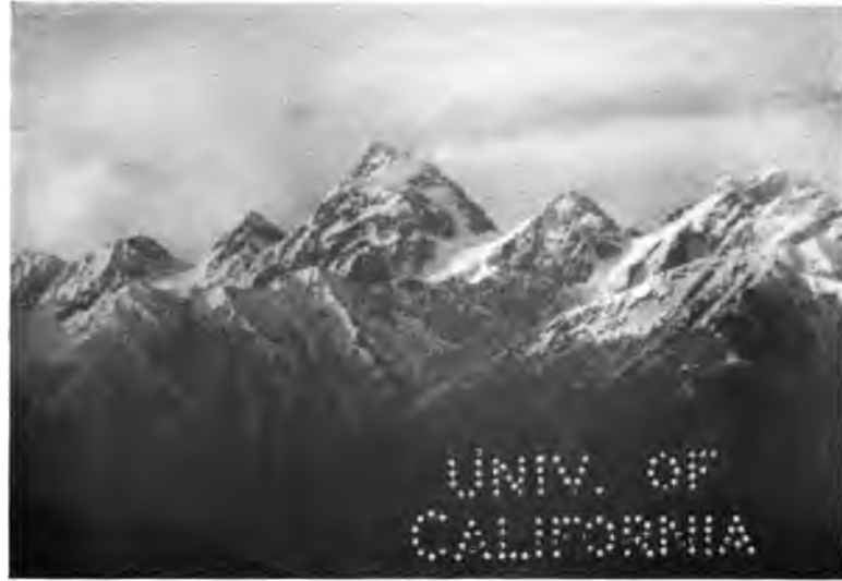
MALI PARBAT KAGHAN.