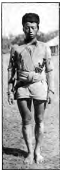
A RAI EASTERN NEPAL.