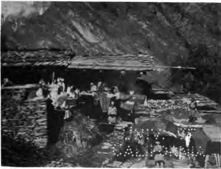
KWĀSI VILLAGE, CHAMBA.