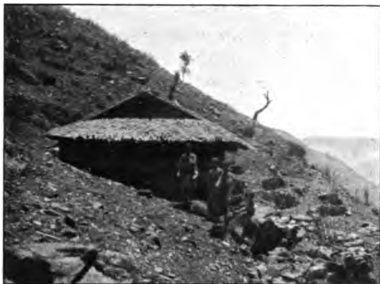
LIMBU HOUSE WITH BURNT HILLSIDE.