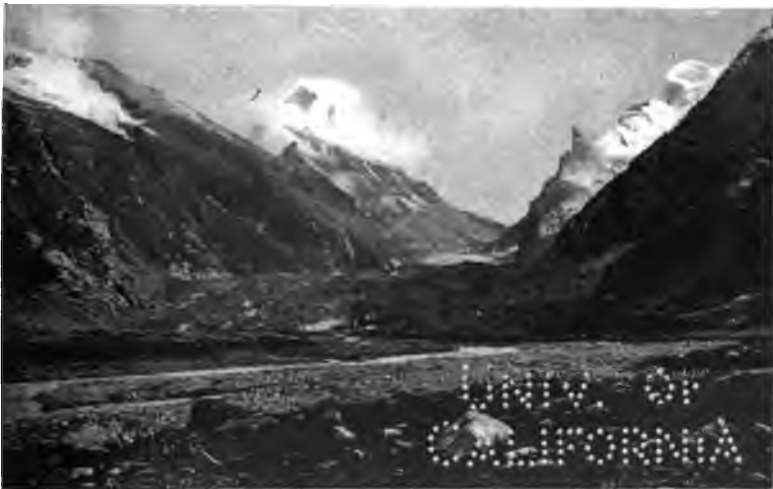
END OF BHOT KHOL GLACIER.