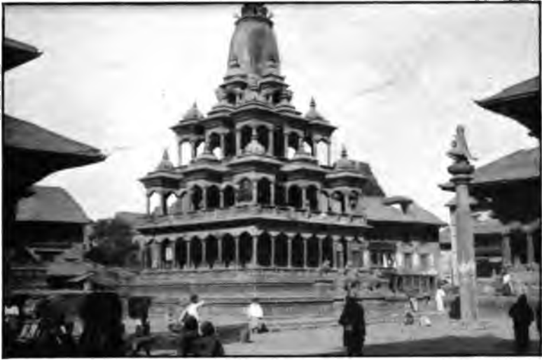
TEMPLE OF BHIM SEN.