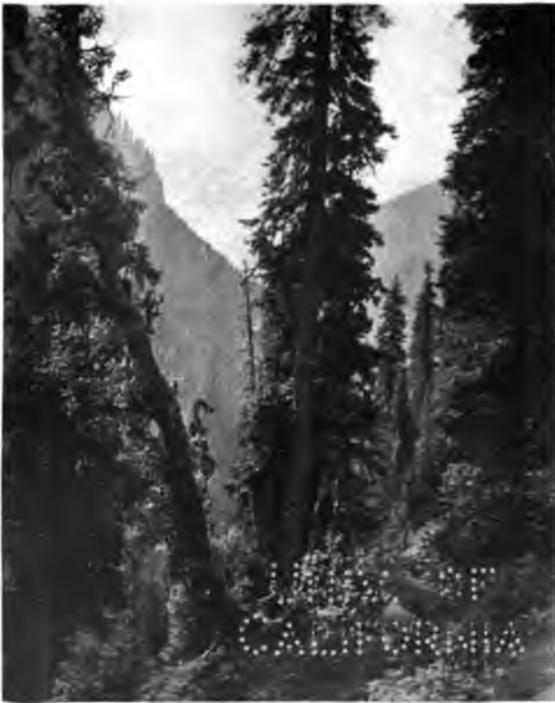
FOREST SCENE, BICHALA, KAGHAN.