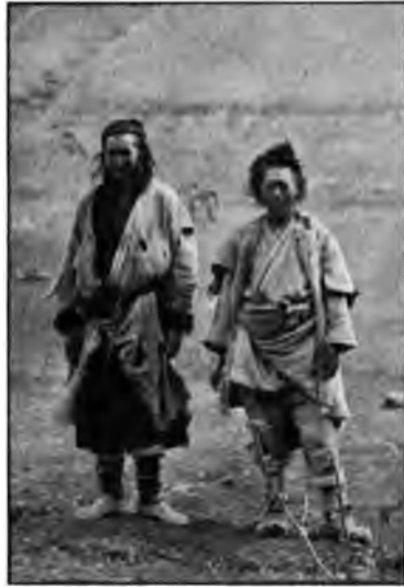
THIBETANS OF LITTLE THIBET