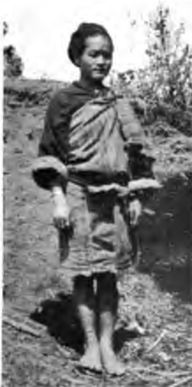
LEPCHA MAN, SIKKIM.