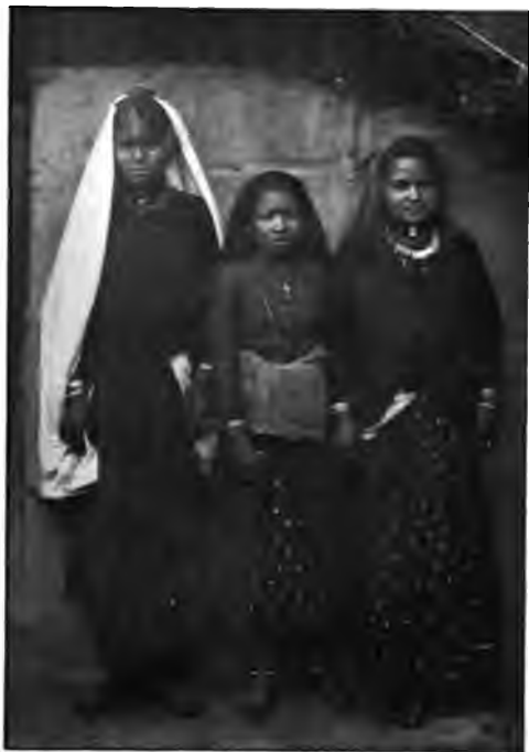
GIRLS OF THE GURUNG TRIBE.