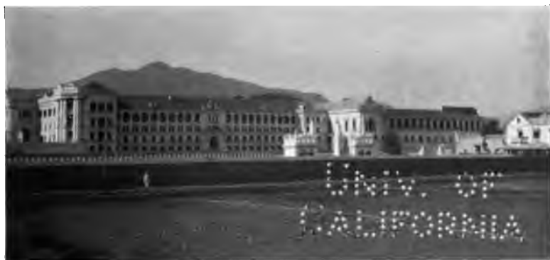
PALACE OF MAHARAJ ADHIRAJ.