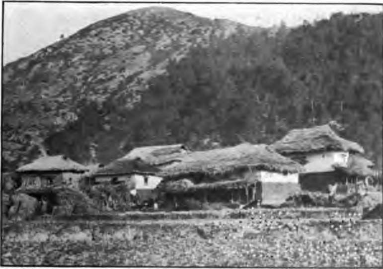
VILLAGE, NEPAL VALLEY.