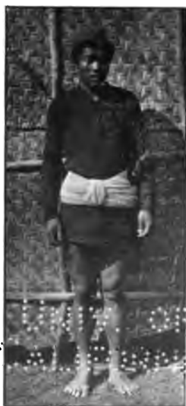
A LIMBU EASTERN NEPAL.