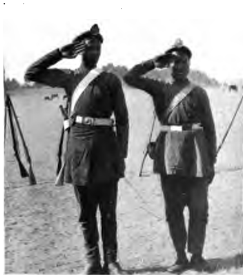
GOORKHA SOLDIERS SHOWING HEAD-DRESS.