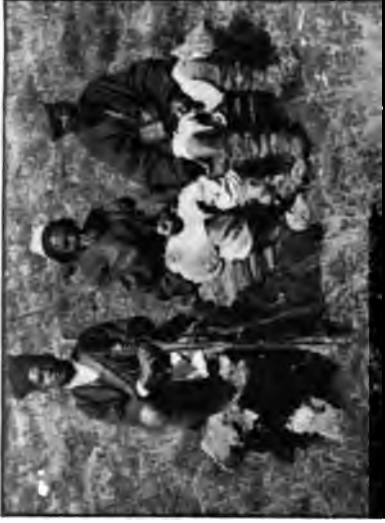
HINDU KOOSH SHIKARI AND GOORKHA RIFLEMAN.