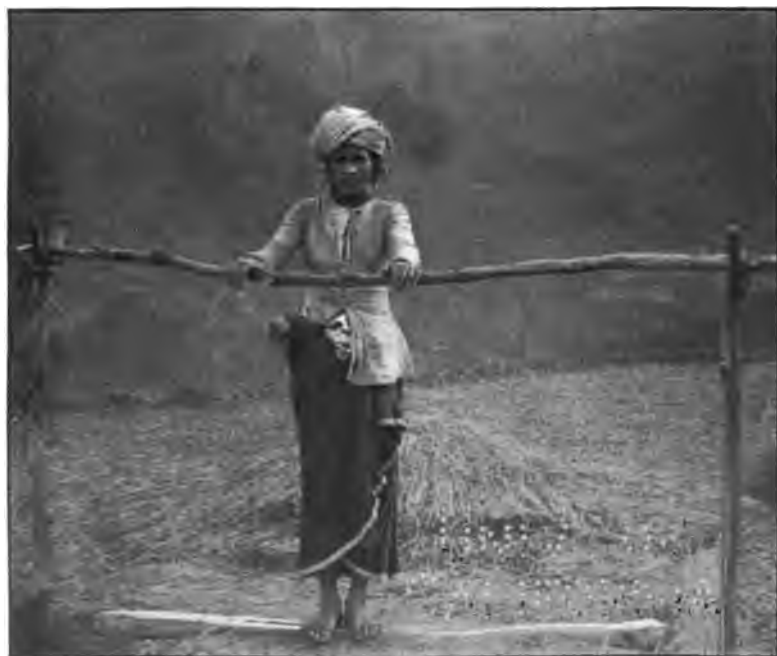
WOMAN THRESHING, CENTRAL HIMALAYA.