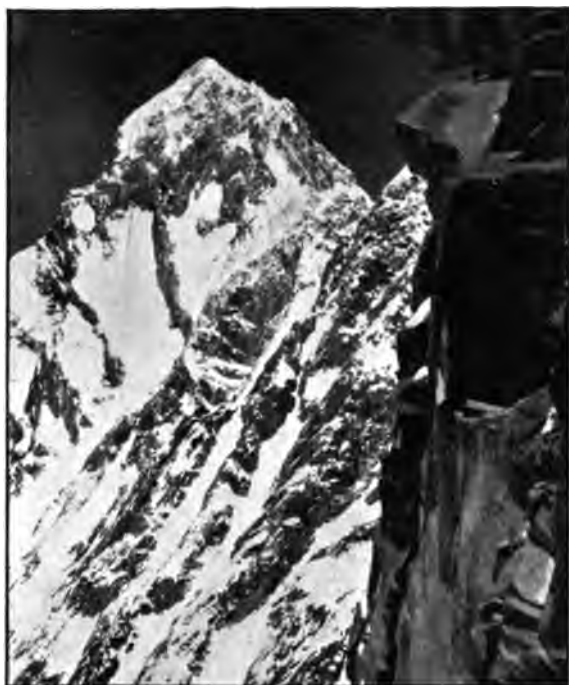
DUNAGIRI FROM THE BAGINI PASS.