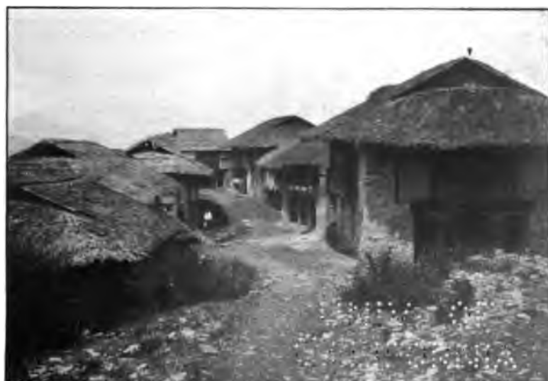
LIMBU VILLAGE OF TINGLING.