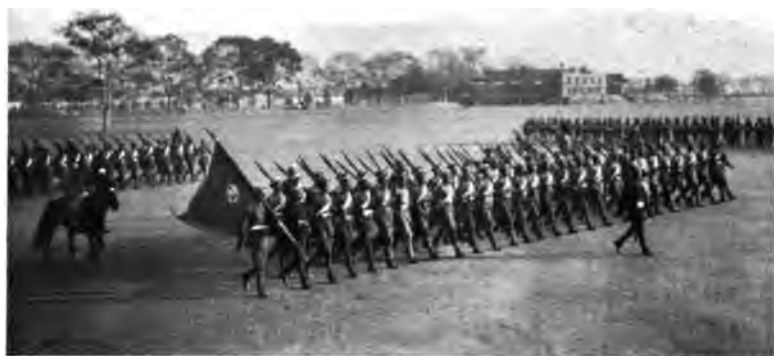
KALI BAHADUR REGIMENT MARCHING PAST.