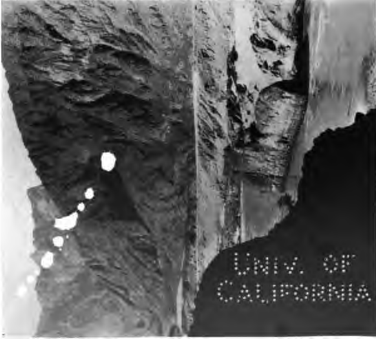
INDUS ABOVE CHILAS.