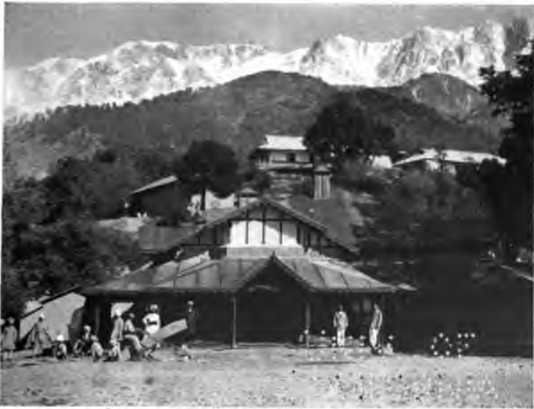
OFFICERS' MESS 1ST (P.W.O.'S.) GURKHA RIFLES, DHARMSALA.