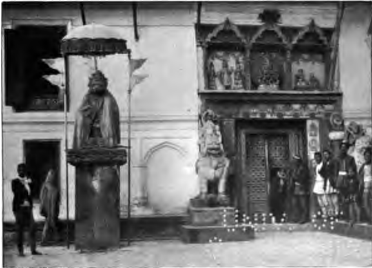
THE HANUMAN DHOKA, KHATMANDU.