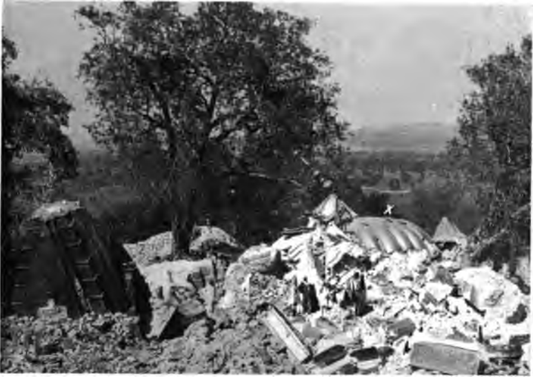
GOLDEN TEMPLE RUINS AFTER THE EARTHQUAKE. (THE REMAINS OF THE DOME ARE SHOWN BY AN X.)