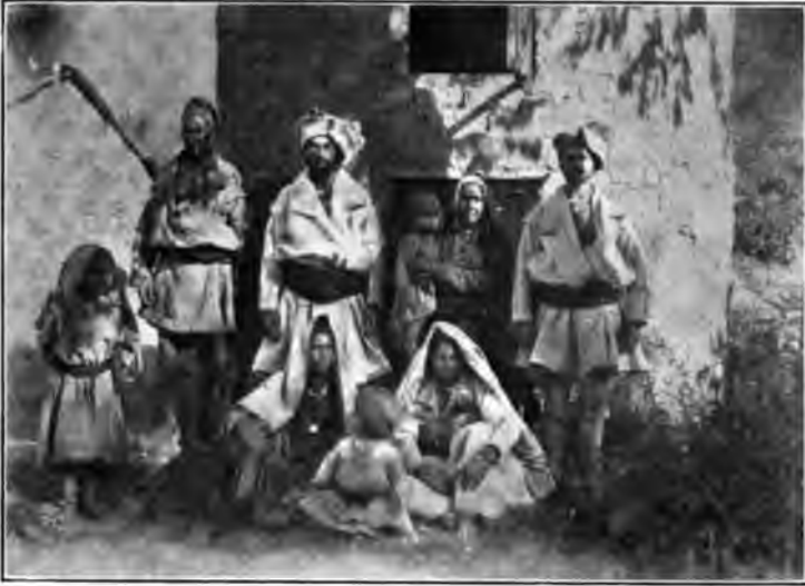
GADDI FAMILY—FOUR GENERATIONS.