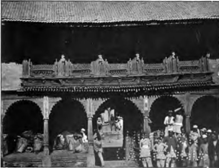
CARVED BALCONY, KHATMANDU.