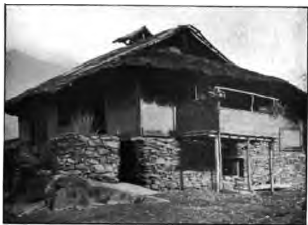
THE HOUSE OF THE KAZI OF YOKSUN.