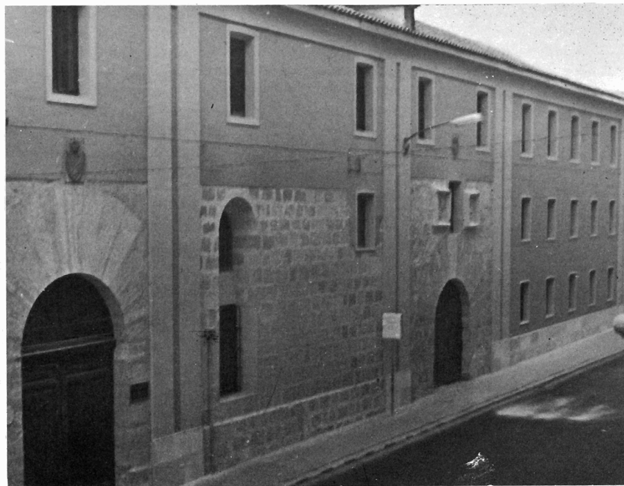
SCOTS COLLEGE, VALLADOLID—PRINCIPAL FAÇADE

The upper photograph shows the brickwork of the 1860 repairs which, as seen in the lower photograph, was given a cement facing in 1954. Around the two doors, however, the old stonework has been retained. The left hand door, which is that of the "old part" of the college of S. Ambrosio and which was the one used in Geddes' time, was brought back into use in 1955.