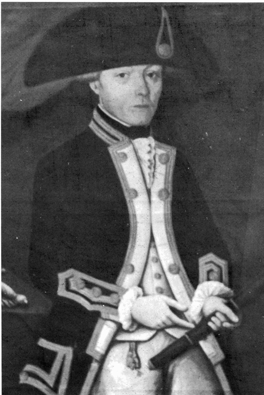
DUKE OF WELLINGTON

This portrait is preserved in the college's country house at Boecillo, which Wellington used as his headquarters in 1812.