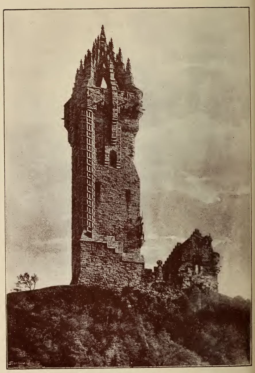
NATIONAL WALLACE MONUMENT, STIRLING.