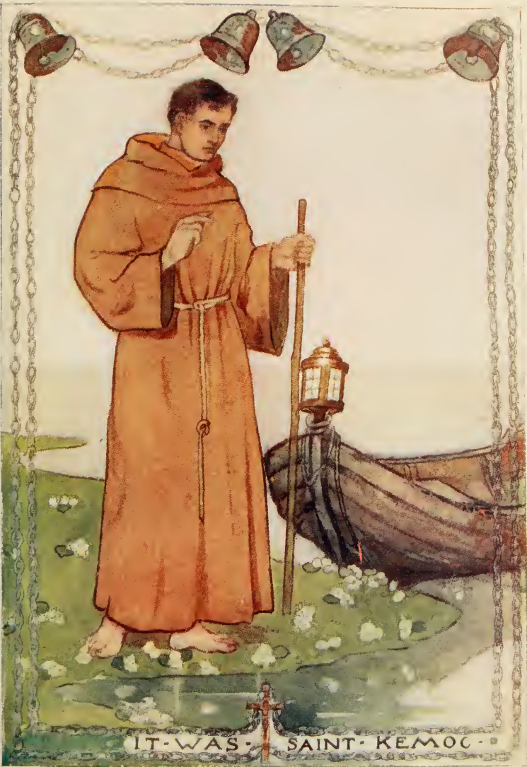
IT WAS SAINT KEMOC