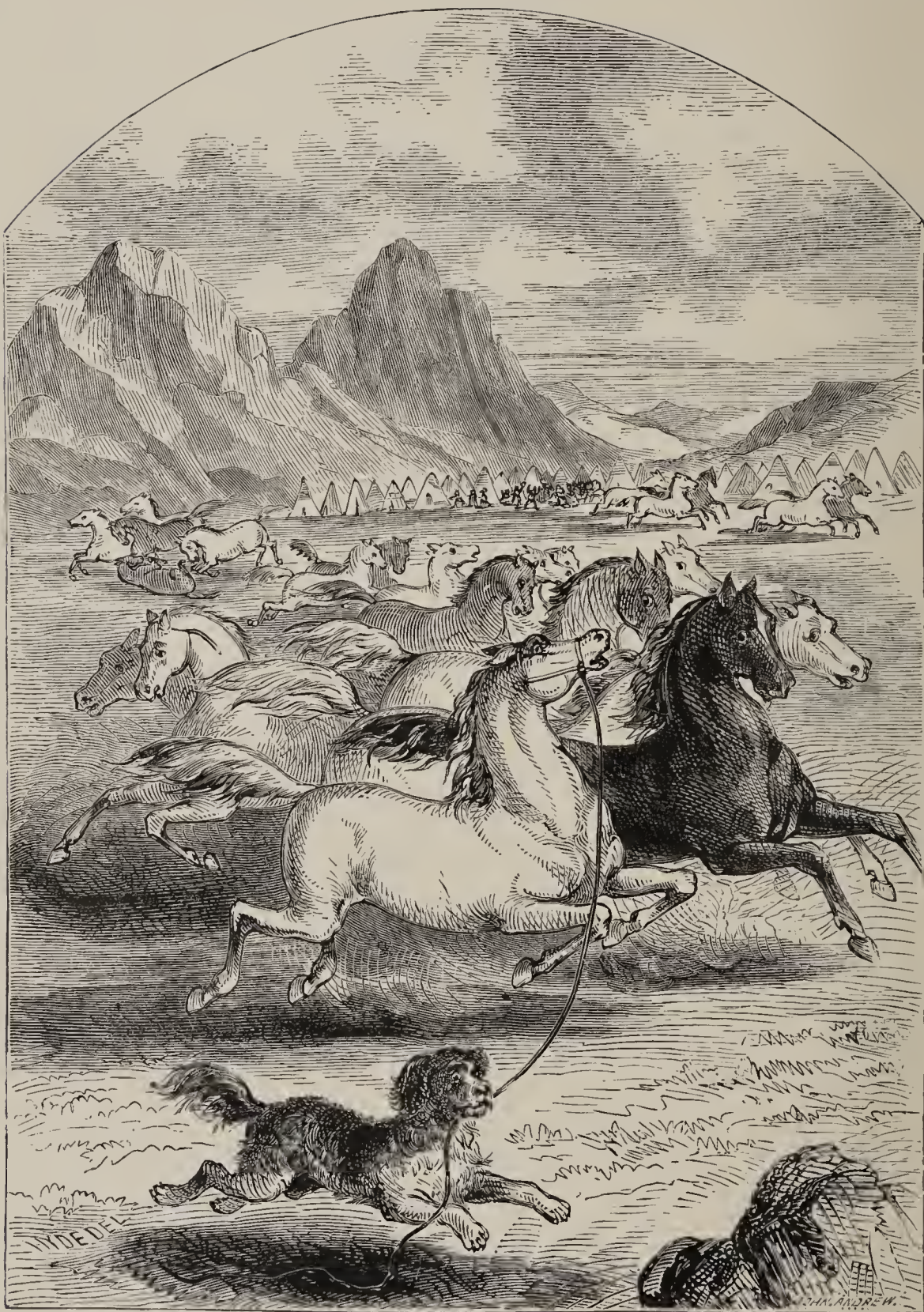
THE STAMPEDE OF WILD HORSES.