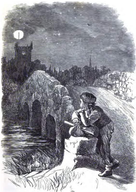
FERGUS RESTING ON THE PARAPET OF THE BRIDGE.