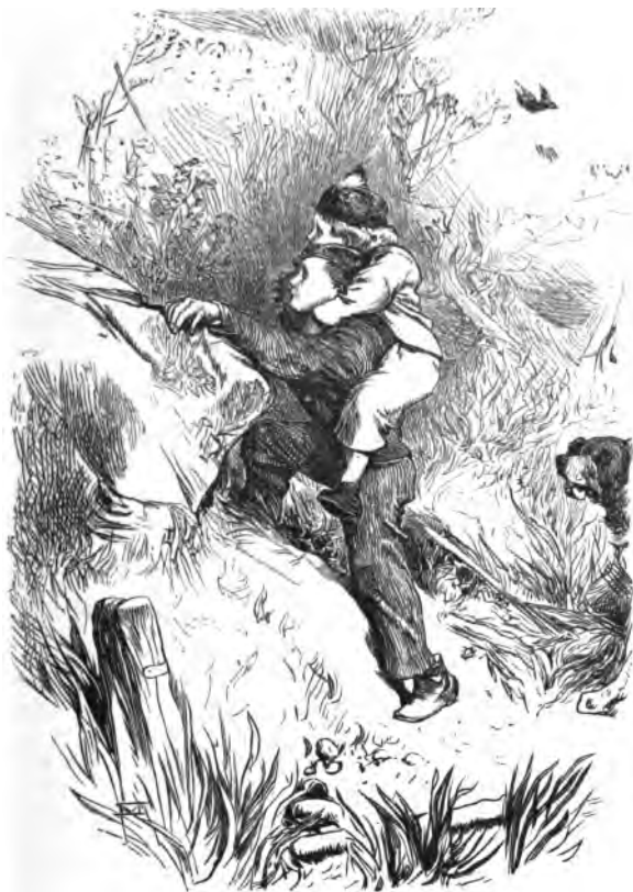
LITTLE NED CARRIED ON FERGUS'S BACK UP THE GLEN.