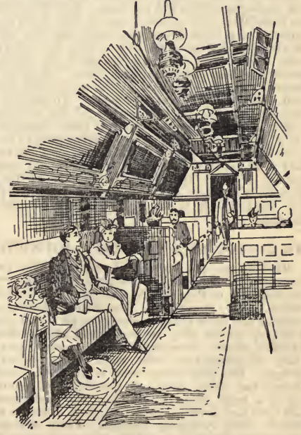
INTERIOR OF CAR.