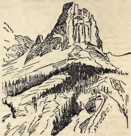
CATHEDRAL ROCK, ROCKY MOUNTAINS.

On leaving the train at Harrison, we found that the news of our coming had gone before us, several Scotsmen being waiting at the station to bid us