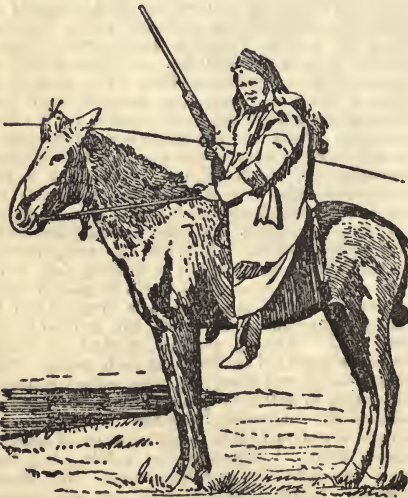
A SIOUX INDIAN.