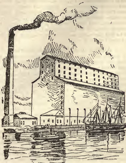
A GRAIN ELEVATOR.

carriage, are sent by train east through the Rocky Mountains, and distributed all through Canada and the United States. Shingles made from the British Columbia cedar have the reputation of being the freest from warping, and the most durable of any.