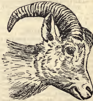
ROCKY MOUNTAIN SHEEP.

is that about six miles from Hope, on the Fraser River. Iron deposits exist on Jaxada Island, and copper deposits have been found at several points on the coast of the mainland. Bituminous coal has been worked for many years at Nanaimo, on Vancouver Island, and several veins have been discovered and wrought on the mainland. Furs and peltries are amongst the most valuable articles of export, the capturing of the animals affording splendid sport. Amongst the most valuable are the