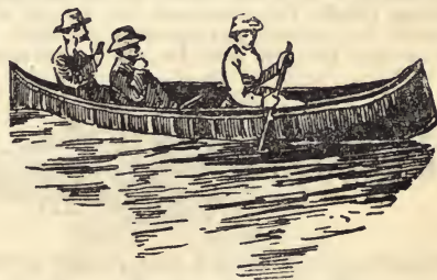
CANOING ON FRASER RIVER.