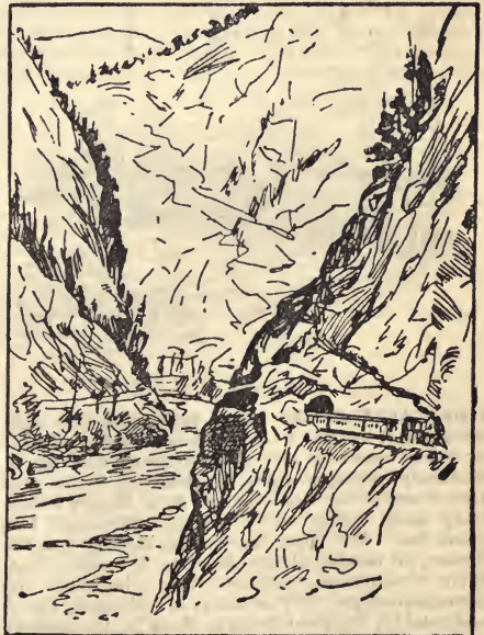
THE FRASER CANYON.

along these, the train doubling and turning upon itself until it reaches the level of the river, 500 feet below. For some time the shades of evening have been gathering around us, and it now becomes quite dark. The conductor tells us it is twenty-two o'clock, and that our beds are prepared; so, retiring to our state-room car, we undress ourselves and go to sleep. All night long the train speeds on its westward course. We rise with the dawn, and just as we reach the observation car the train pulls up at Kamloops, the principal town in the interior of British Columbia. Here we are given half-an-hour to stretch our legs on the platform, a luxury for which we were very thankful. A new engine is attached to the train, and we again resume our journey, following the shore of Kamloops Lake and the mighty Thomson River, through tunnel after tunnel, and then the valley shuts in, and the scarred and rugged mountains frown upon us again. For hours we wind along their sides, looking down upon a tossing, tumbling river, its waters sometimes almost within our reach, and sometimes lost below. We suddenly cross the deep black gorge of the Fraser River on a massive bridge of steel, seemingly constructed in