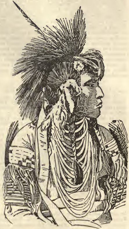
AN INDIAN BRAVE.