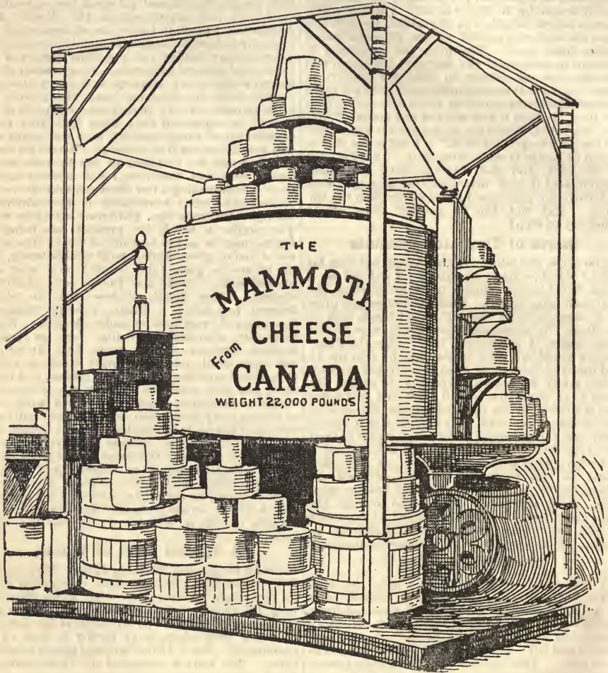
MAMMOTH CHEESE, PURCHASED BY LIPTON.

metto bloom honey, oranges, lemons, and other roots, and specimens of native hemp ropes. Idaho exhibits potatoes, parsnips, beets, pumpkins, wheat biscuits, strawberries, gourds, onions, carrots, turnips, &c. Denmark exhibits dairy utensils, such as separators, churns, refrigerators, butter workers, and weighing scales. In the pavilion is a full-sized native cow stuffed, specimens of margarine, and native boots and shoes. Cape of Good Hope sends ostrich feathers, bush tea, aloes, wool, bushmen's stone implements and weapons, bucha leaves, stuffed ostriches, piles of ostrich eggs, ivory tusks, &c. Wyoming exhibits armchairs of moose horns curiously intertwined, wheat seeds, &c. West Virginia sends lemon juice, tobacco leaf, and seeds.