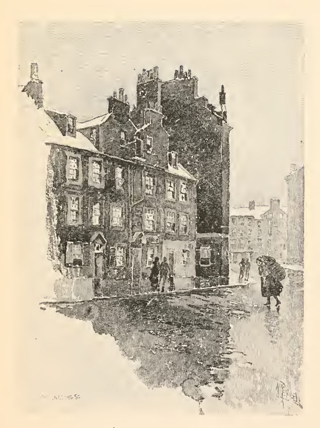
CARLYLE'S LODGINGS, SIMON SQUARE