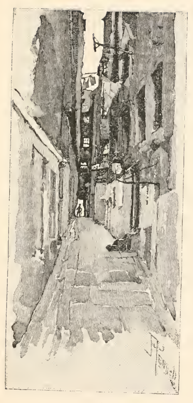
LADY STAIR'S CLOSE