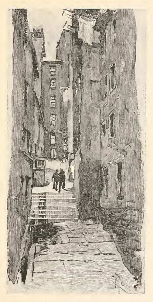
CRAIG'S CLOSE, 265 HIGH STREET