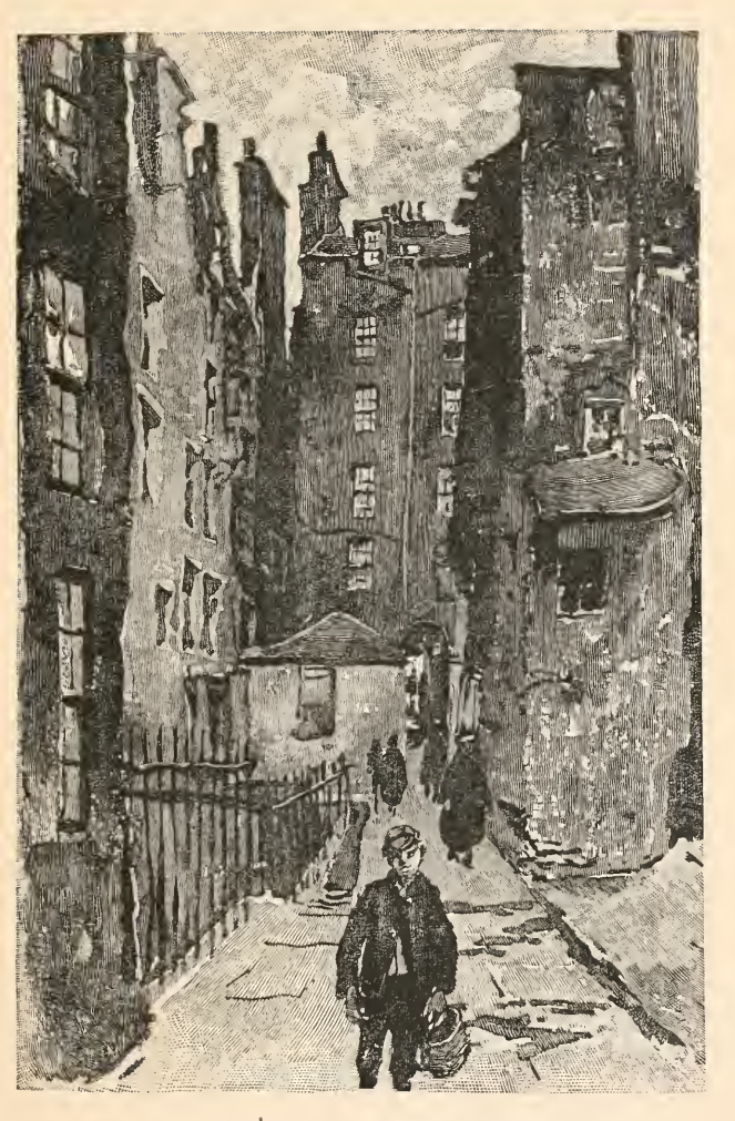
JAMES'S COURT, 501 HIGH STREET