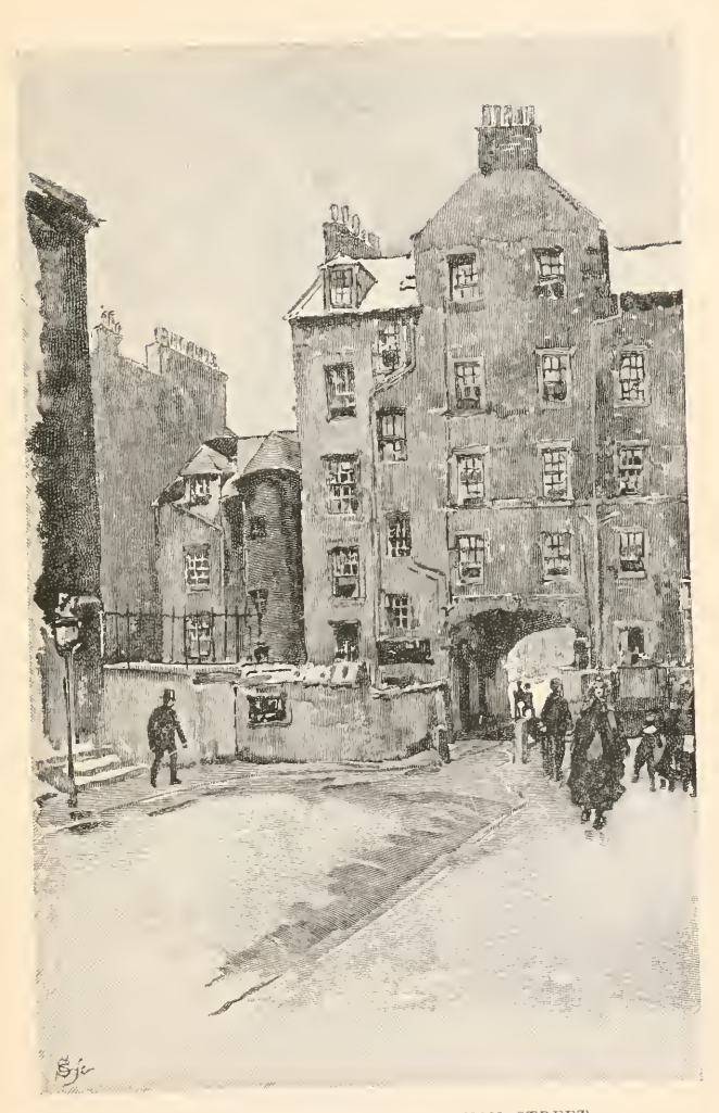
BUCCLEUCH PEND, 14 BUCCLEUCH STREET