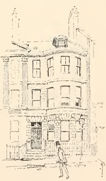
39 CASTLE STREET

was precisely that in which any ordinary herdsman attends cattle to the market, and as his hands, moreover, bore most legible marks of recent sheep-smearing, the lady did not observe with perfect equanimity the novel usage to which her. chintz was exposed. The Shepherd, however, remarked nothing of all this, dined heartily and drank freely, and by jest, anecdote, and song afforded plen-