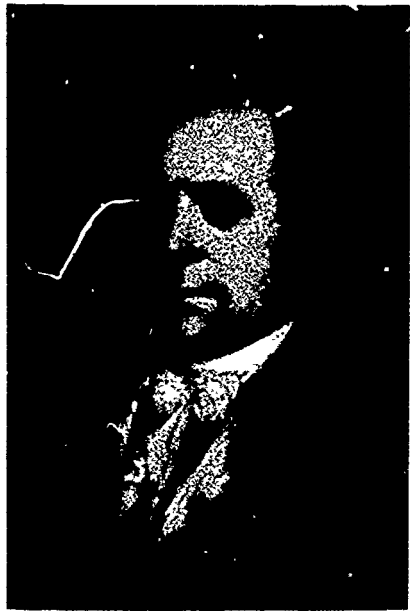
Pastel, by James Sharples, Sr. (c. 1795).

remained on Washington's staff as a volunteer without rank or pay for two and a half years. During that period he saw action in the battles of Monmouth and Springfield, New Jersey, and became a valued member of Washington's immediate "military family," along with men like Henry Knox, Alexander Hamilton, and the Marquis de Lafayette.