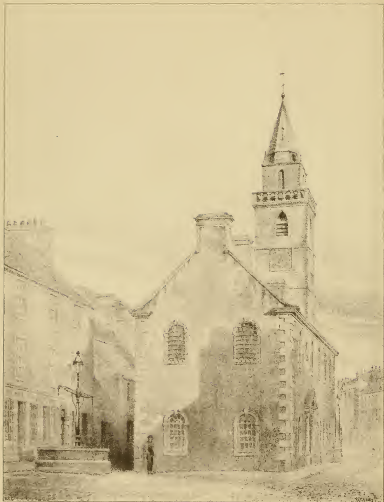
The Tolbooth of Irvine - 1860.