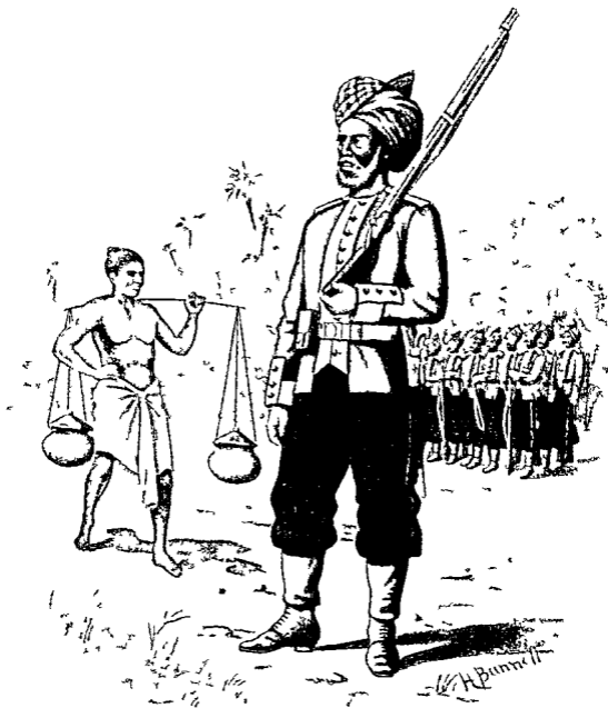
FIRST MADRAS PIONEERS