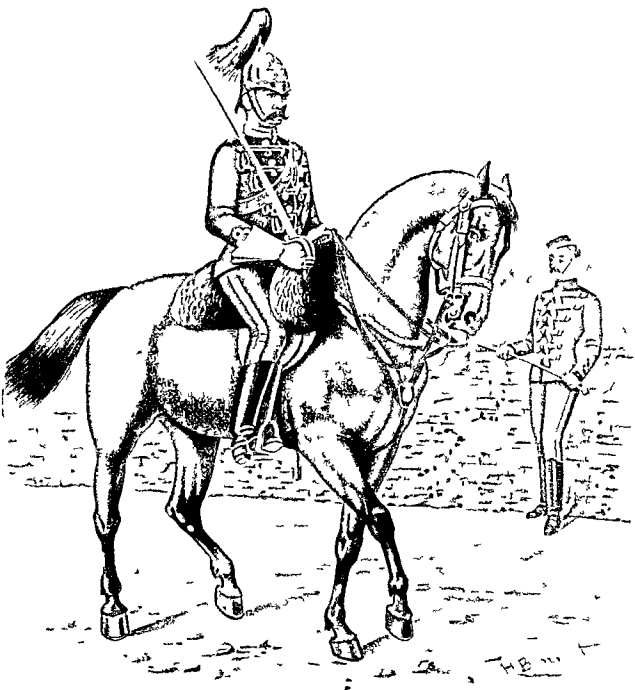
THE 6th REGIMENT OF CAVALRY (HUSSARS CANADA)