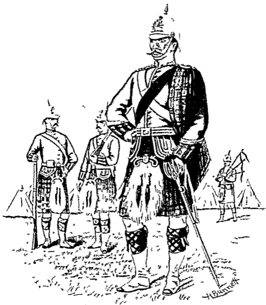
THE 5th ROYAL SCOTS OF CANADA.