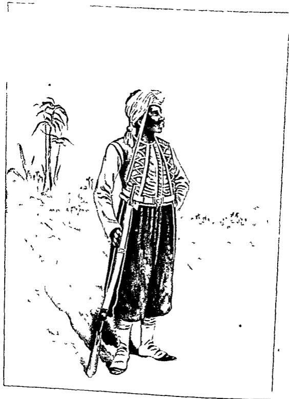
WEST INDIA REGIMENT