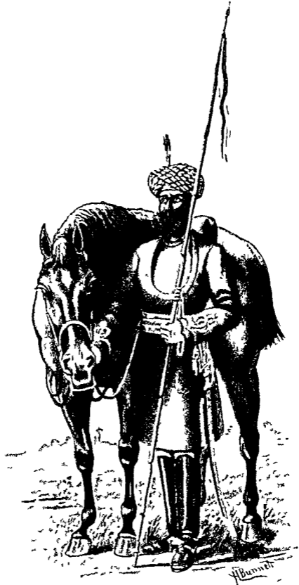
THE GOVERNOR GENERAL'S BODY GUARD CALCUTTA