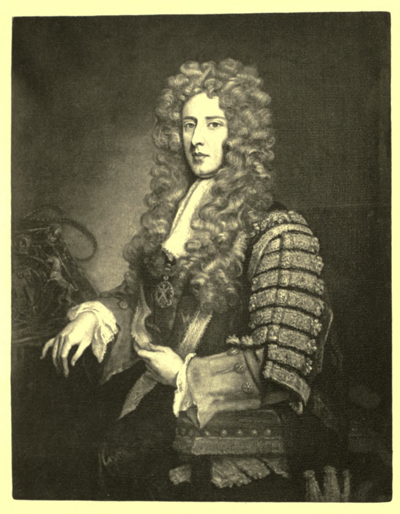
James, 1st Eurl of Scafield. Lord High Chancollor of Scotland. BY SIR CODFREY KNELLER.