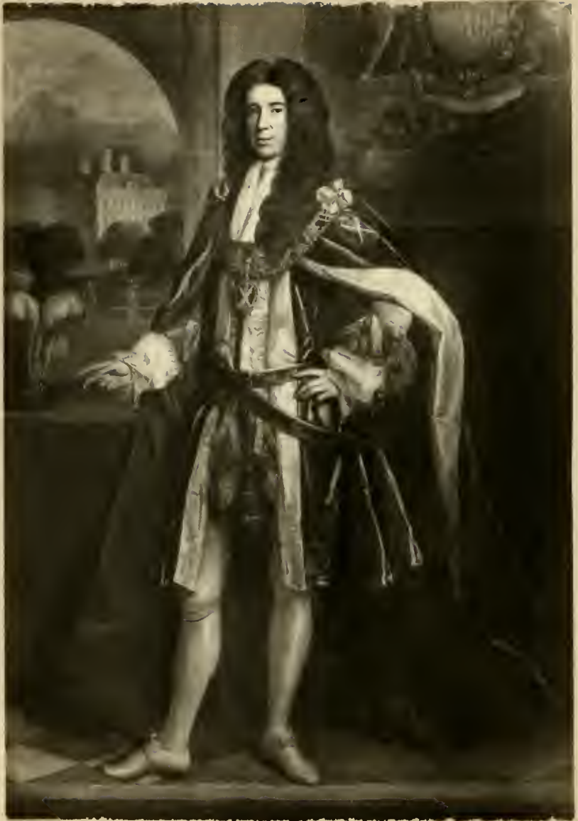
JOHN, 1 ST DUKE OF ATHOLL, K.T.