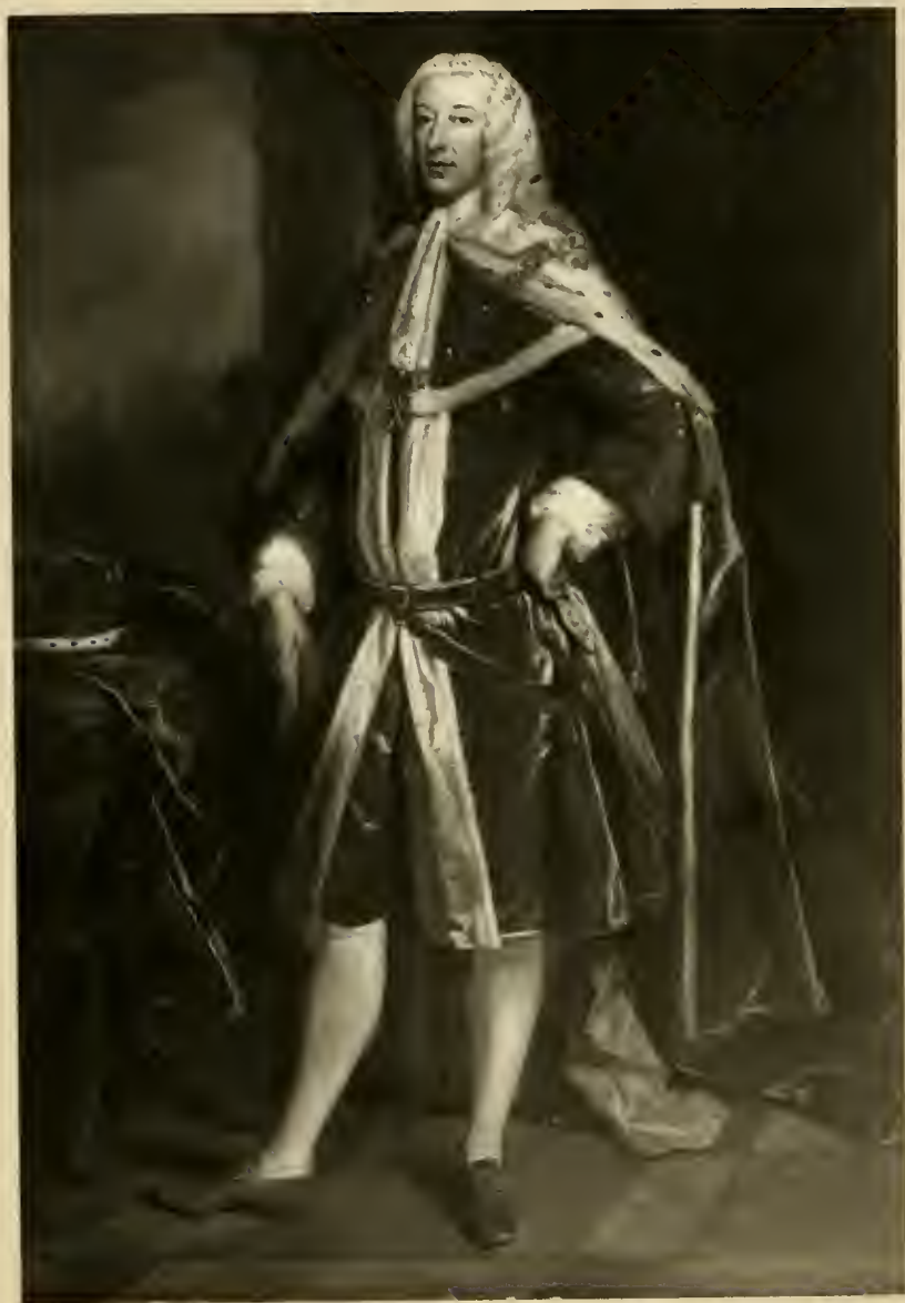
JAMES, 2 ND DUKE OF ATHOLL, K.T.