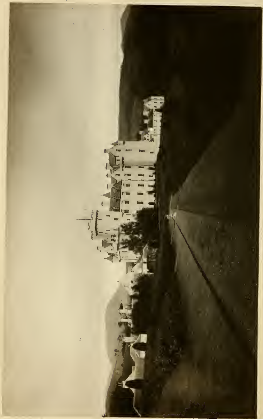
BLAIR CASTLE, 1896 BACK ELEVATION