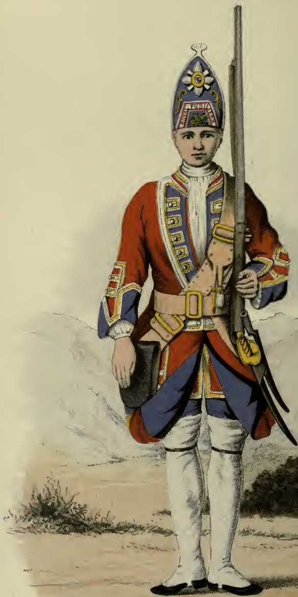
UNIFORM OF THE ROYAL SCOTS FUSILIERS IN 1742.