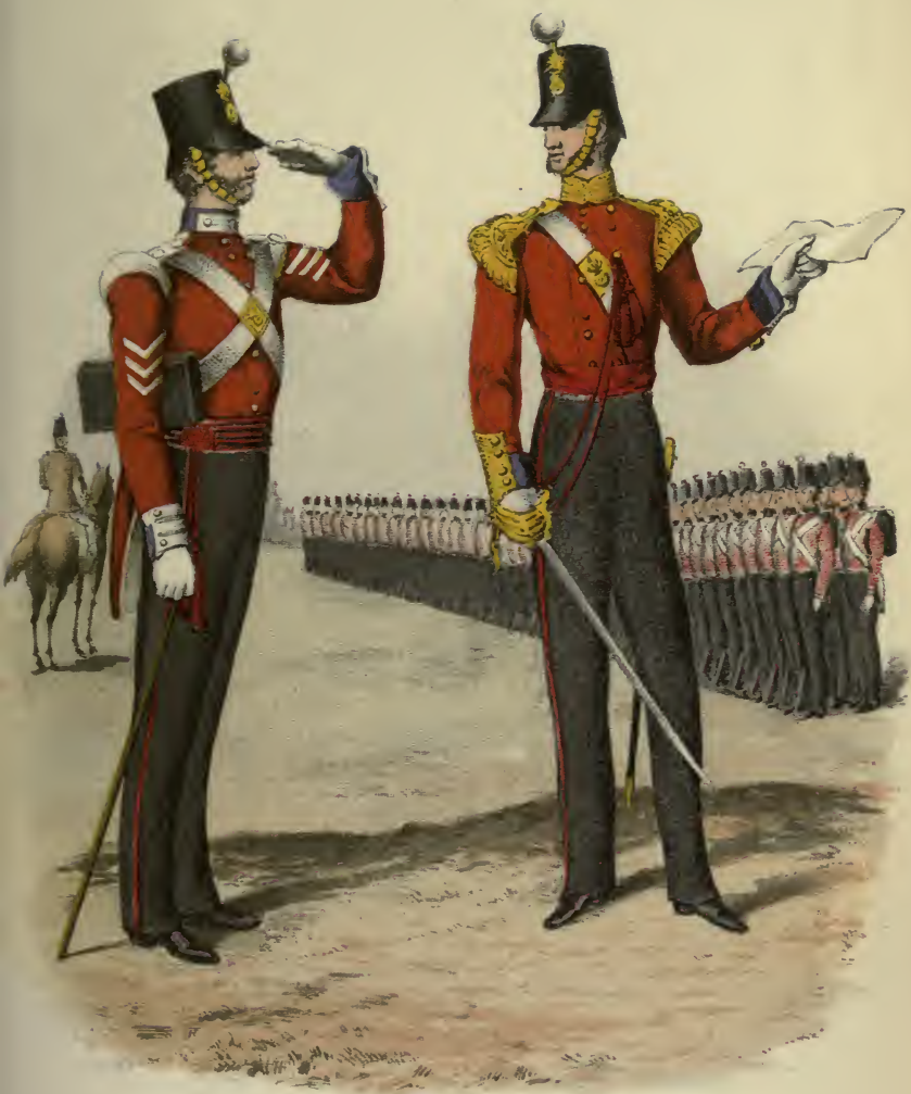
UNIFORM OF THE ROYAL SCOTS FUSILIERS IN 1847.