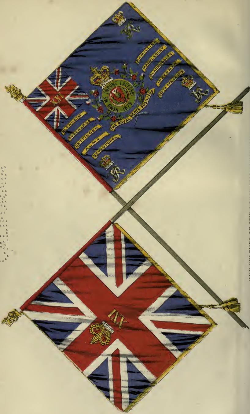
THE COLOURS OF THE ROYAL SCOTS FUSILIERS.