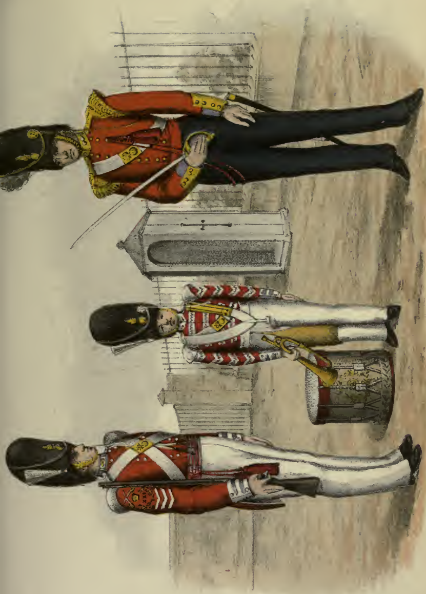
UNIFORM OF THE ROYAL SCOTS FUSILIERS IN 1827.