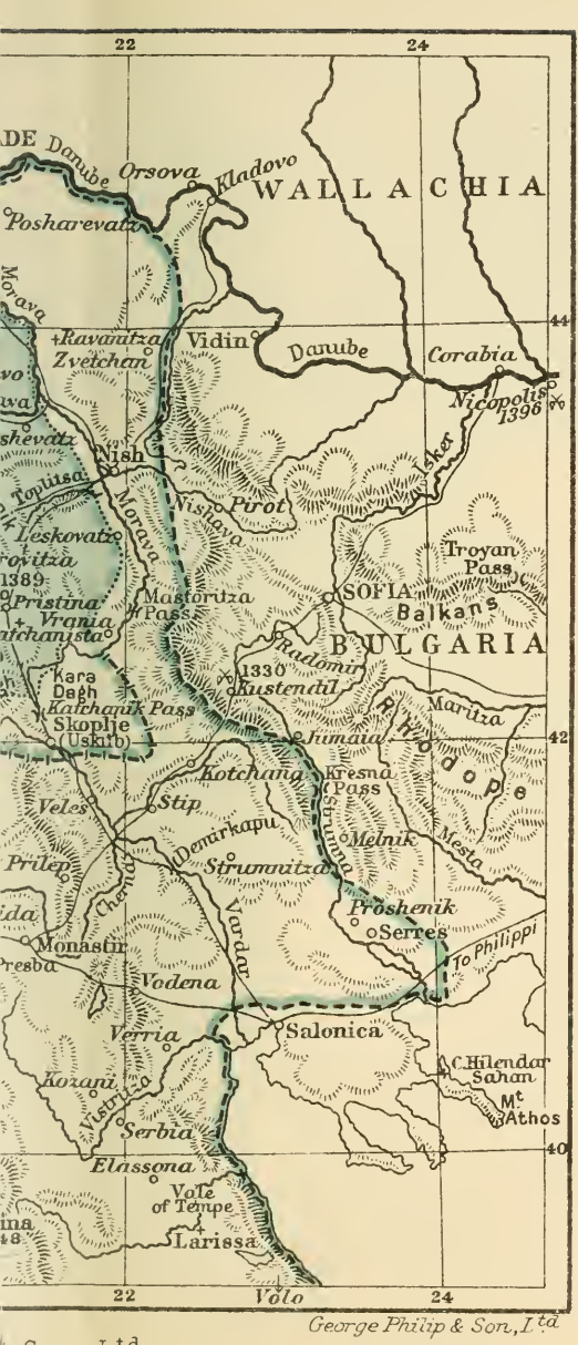
& Sons, Ltd