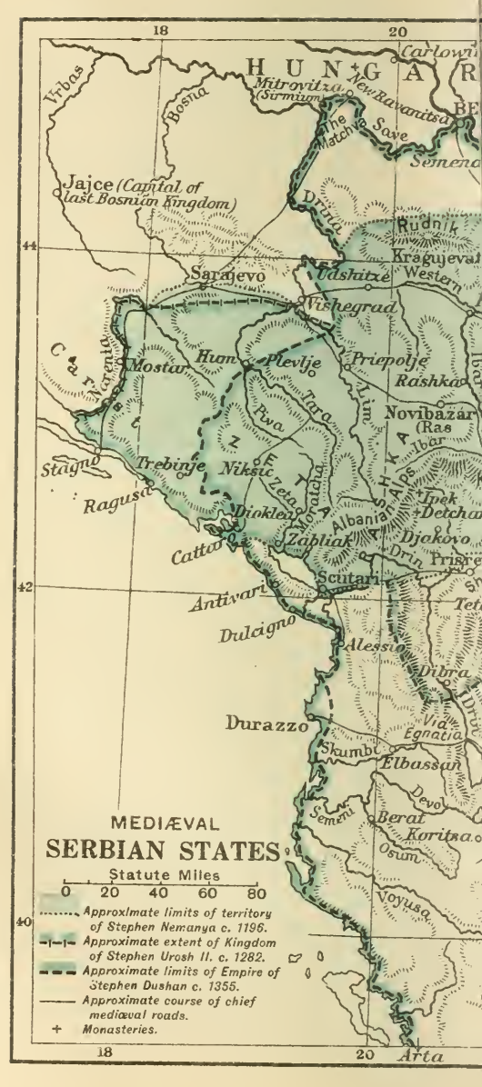
London: G. H