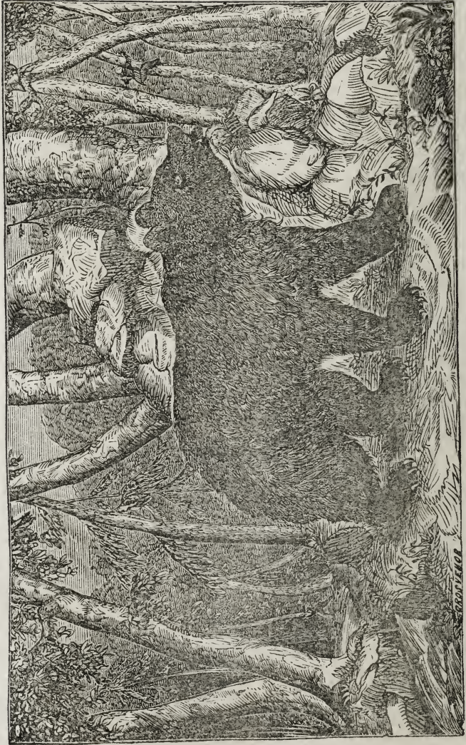
T U E B E A R .