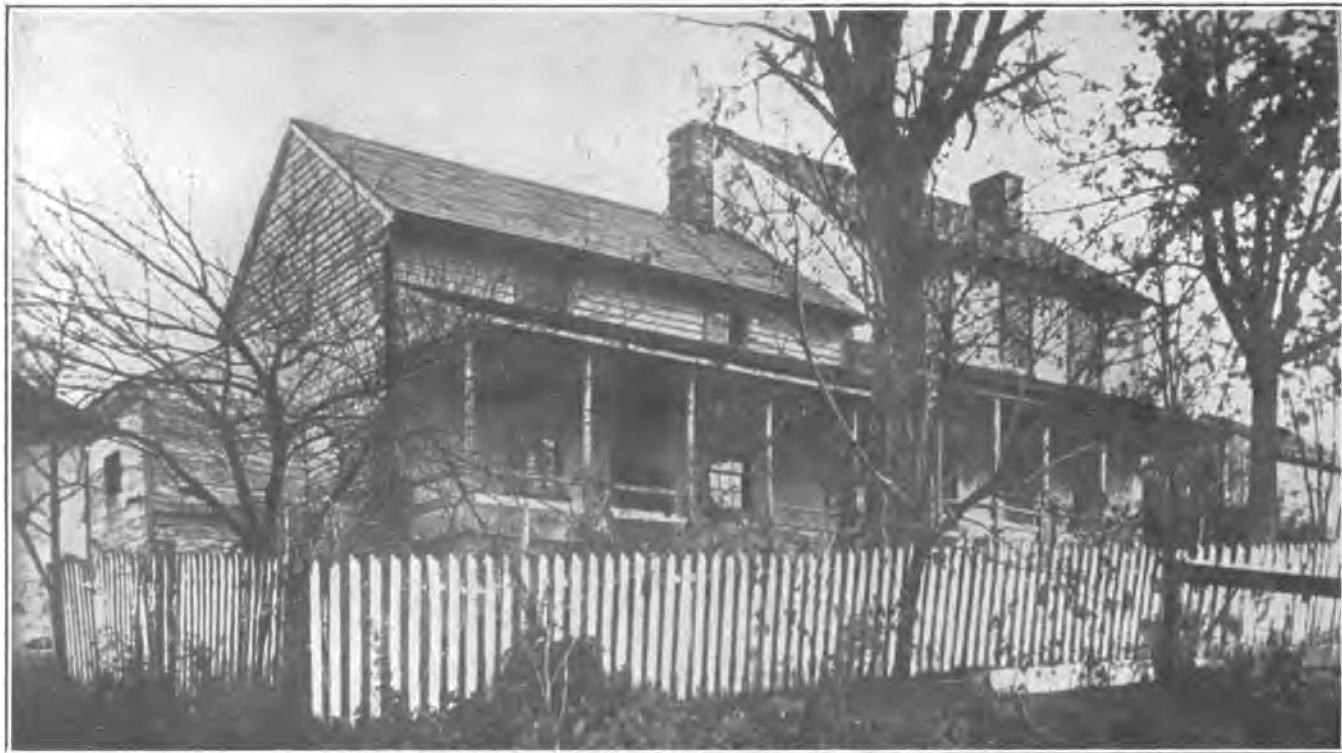
BIRTH-PLACE OF SENATOR JAMES ROSS