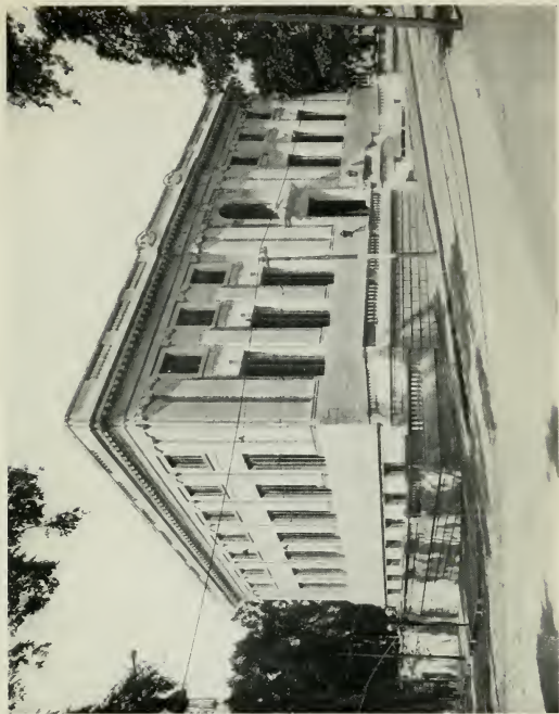
JOHN HAY MEMORIAL LIBRARY