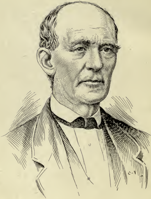
WILLIAM H. MCGUFFEY