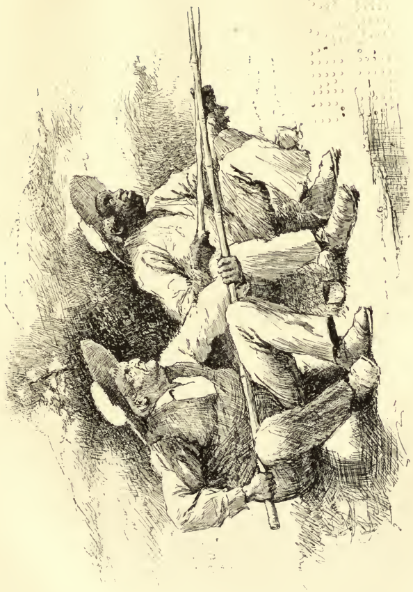
SIDE BY SIDE ON THE SANDY BANK OF THE STREAM