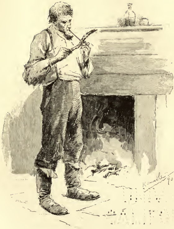
HE FILLED HIS PIPE, AND LIGHTED IT