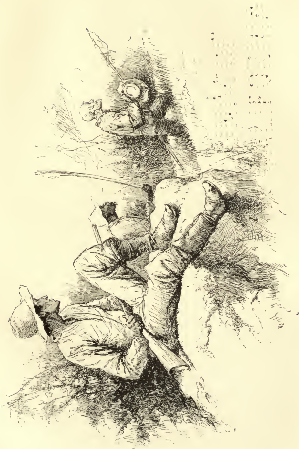
HE WATCHED THIS STRANGE PROCESSION