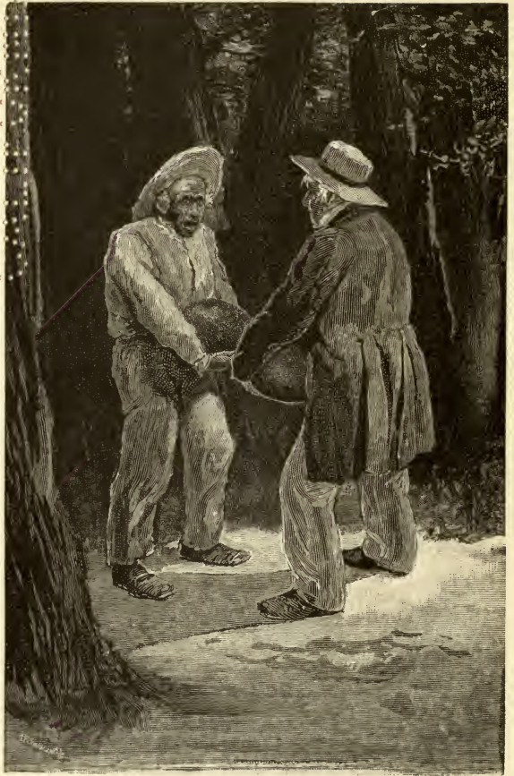
“JUDAS! YOU OLD COON!” — “MARS BEN!” (Page 72)