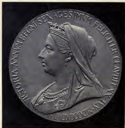
MEDAL COMMEMORATIVE OF QUEEN VICTORIA'S DIAMOND JUBILEE OF 1897