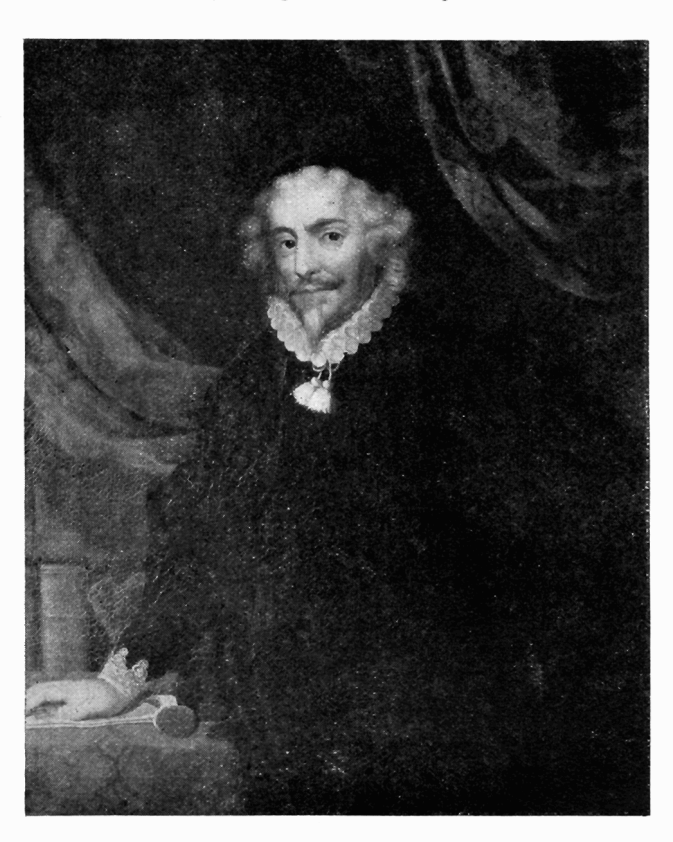
(Original picture in the Hall of the Royal Faculty of Physicians and Surgeons of Glasgow)