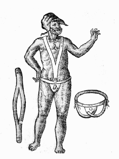
FIGURE OF 16TH CENTURY TRUSS (From Peter Lowe's "Chyrurgerie")

The fact that physicians and surgeons were both included in the operation of the original Charter, and that they have remained united in this body to the