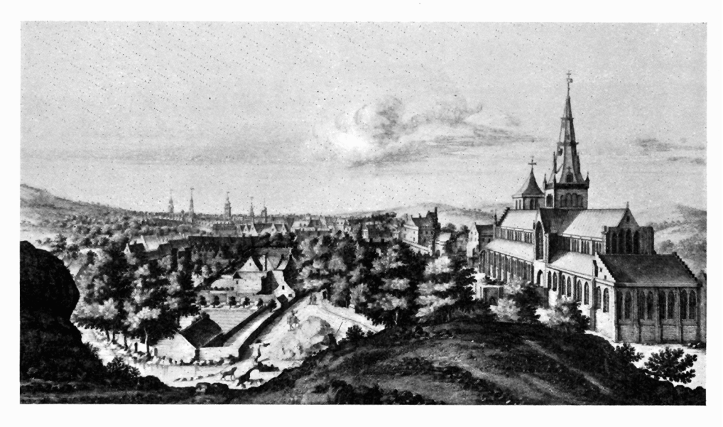
GLASGOW IN THE 17TH CENTURY, FROM THE EAST

GLASGOW, until the early part of the 19th century, was not a town of great size. About the middle of the 16th century it seems to have occupied only the eleventh place in size among the Scottish towns, with a population of between four and five thousand, and even at the beginning of the 17th century it occupied about the same relative position. It consisted practically only of the High Street,