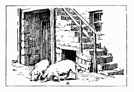
SWINE IN EDINBURGH STREETS Showing the outside stair, which was a feature of old Scottish houses, with the sty beneath it

in the streets and pick up what they could. In 1450, it was ordained that all men and women who had "swyne" wandering in the town should remove them out of the town or keep them "in band." If the swine were found loose, they were to be forfeited and their price applied to the building of the Kirk. In 1494, various regulations were laid down in regard to the sale of poultry, geese, flesh and other easily corruptible kinds of food. It is quite in accord with recent legislation that the dealers in poultry, geese and other wild fowl