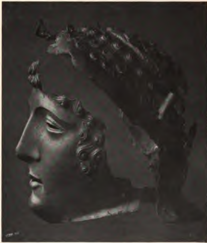
IRON HELMET WITH IRON FACE MASK