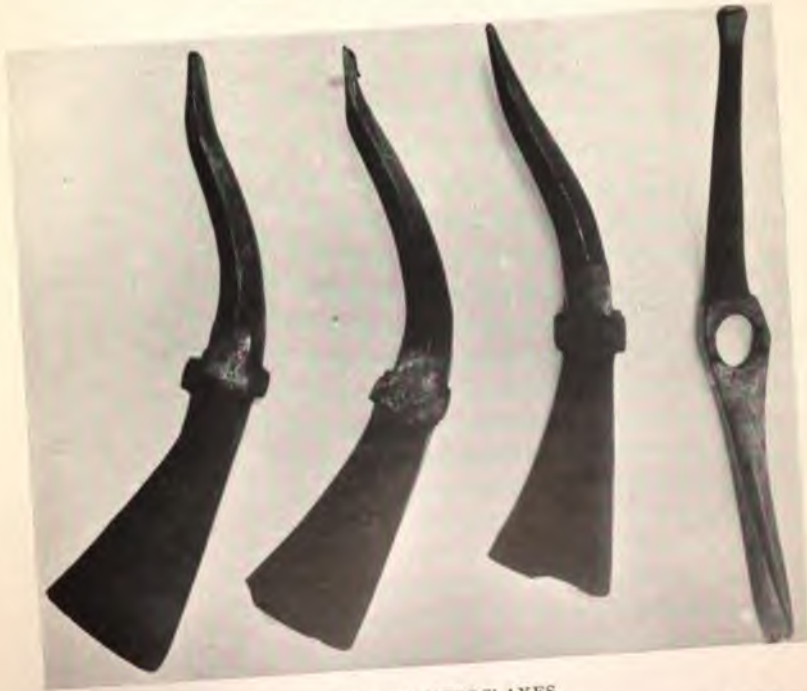
FOUR PIONEERS' AXES