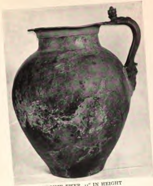
BRONZE EWER, 11" IN HEIGHT