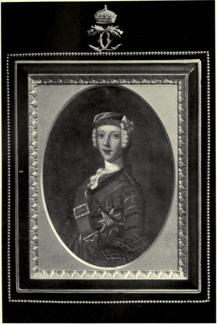
PRINCE CHARLES EDWARD