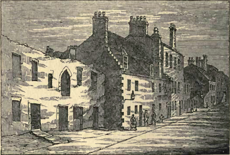
The Auld Pedagogy.

The inferior position of Glasgow as a bishop's burgh of barony and regality has been unduly emphasised by some of its former historians. Thus MacGeorge, while admitting the advantage of a clerical as compared with a lay lord-superior, does not recognise that Glasgow, by virtue of its earliest charters, had, as our author says, 'trading rights, home and foreign, as full as any enjoyed by a royal burgh.' It is true that it had not full freedom in the election of its magistrates, but even here the burgesses possessed a certain liberty of choice. The bishops were zealous upholders