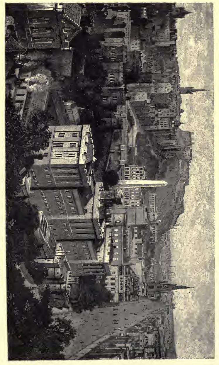
BIRD'S-EYE VIEW OF THE CITY OF EDINBURGH FROM CATON HILL Scotland, vol. one.