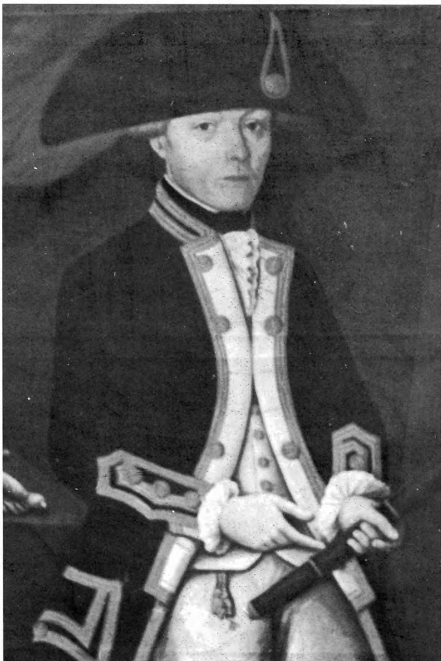
DUKE OF WELLINGTON

This portrait is preserved in the college's country house at Boecillo, which Wellington used as his headquarters in 1812.