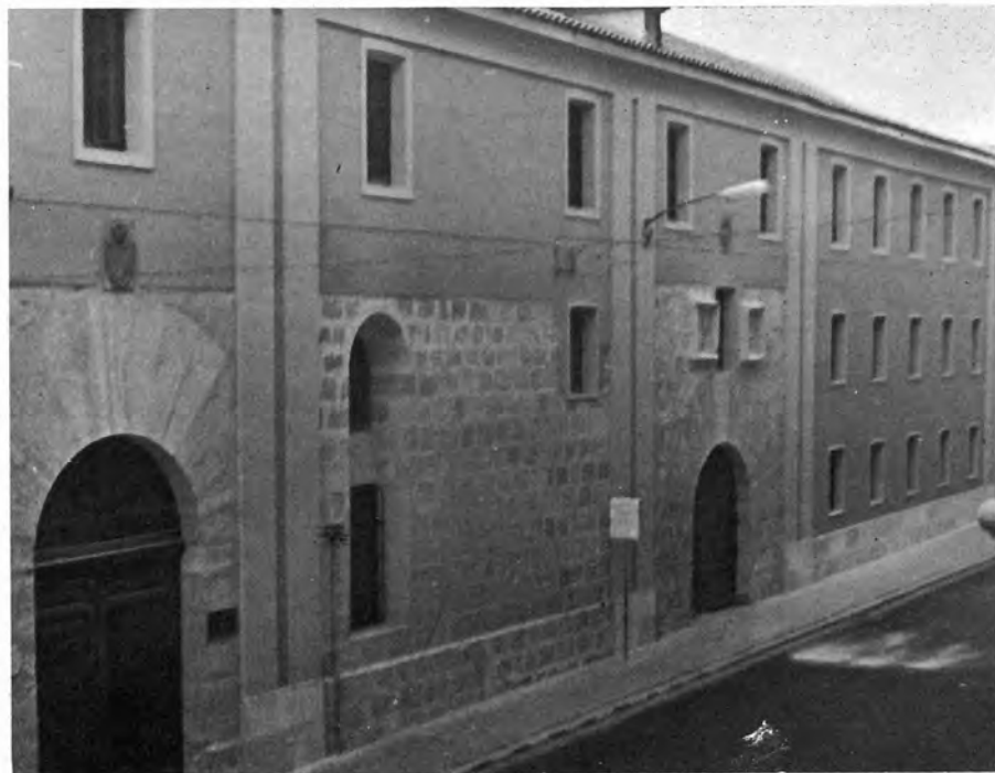
SCOTS COLLEGE, VALLADOLID — PRINCIPAL FAÇADE

The upper photograph shows the brickwork of the 1860 repairs which, as seen in the lower photograph, was given a cement facing in 1954. Around the two doors, however, the old stonework has been retained. The left hand door, which is that of the "old part" of the college of S. Ambrosio and which was the one used in Geddes' time, was brought back into use in 1955.