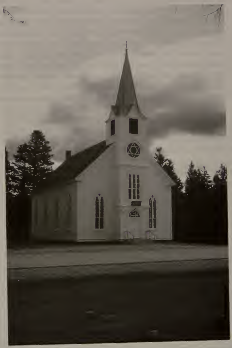
Figure 3: Farquharson Memorial Church, Middle River, Cape Breton