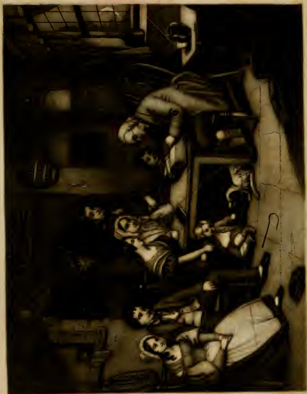
THE STUDENTS OF THE NEW YORK FREE SCHOOL